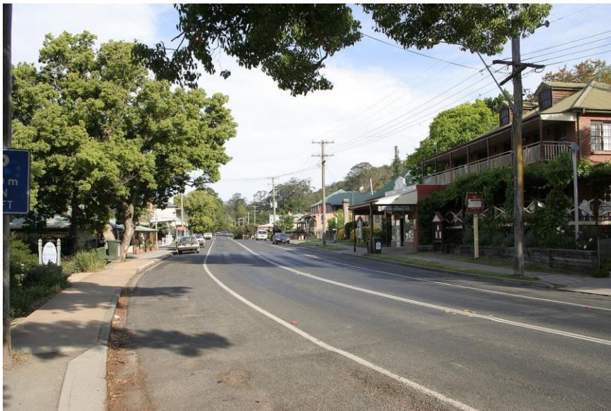
Image 41 – The main street of the town of Kangaroo Valley is known as Moss Vale Road and it exudes old world charm. The population of this town is only 879 people (2016 Census). It has a variety of arts and craft shops, restaurants and cafes, a hotel, club, post office, supermarket and other businesses making it an ideal weekend getaway type of place. It has changed very little in the past 130 years. Tourism and outdoor recreation are now the primary industries here. It has also become a desirable “tree change” destination for people leaving the big cities. There are a large number of hobby farms and weekend residents who live and holiday on a few hectares to escape the city life. Members of rock bands INXS and Midnight Oil have also bought into the valley.