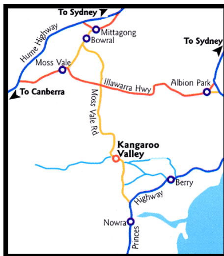
Image 2 – A map showing the main roads in the Kangaroo Valley area. The Kangaroo River goes through the Kangaroo Valley.