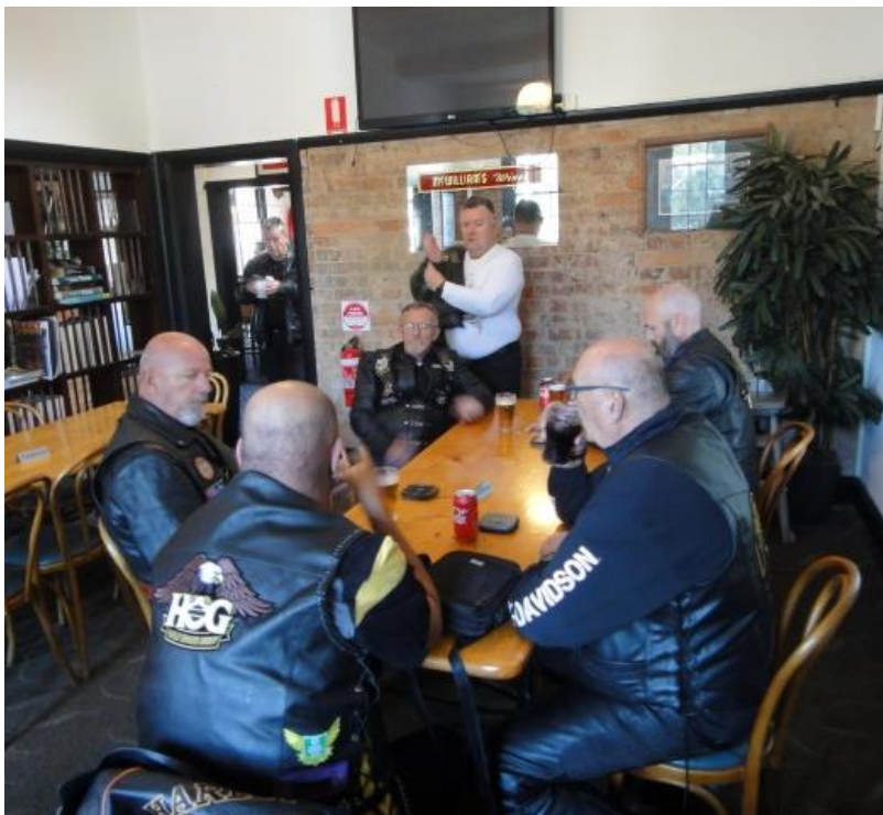
Image 47 – We have a room reserved in the Hotel for our lunch. We never go anywhere unannounced.