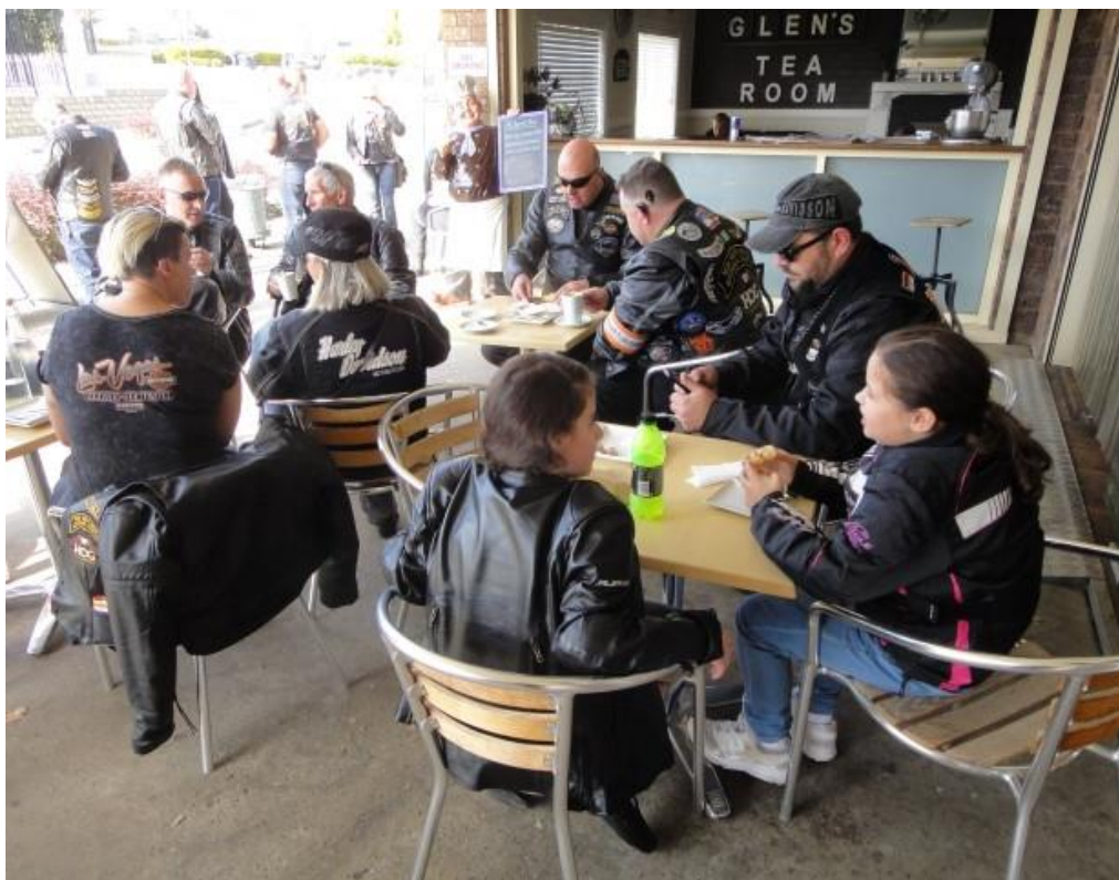
Image 23 – The weather is great, the company is great, the bikes are great, the ride is great, get the picture!!