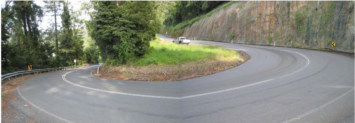
Image 36 – The Barrengarry Bends throw everything at you including tree litter and debris, moisture on parts of the road due to perpetual shading from the sun, a mix of varying hairpins, on-coming traffic, and steep ascents and descents, you have to have your wits about you going up and down this valley. Despite this one feels quite satisfied after successfully completing this roadway. It gives you the opportunity to work on honing your cornering skills