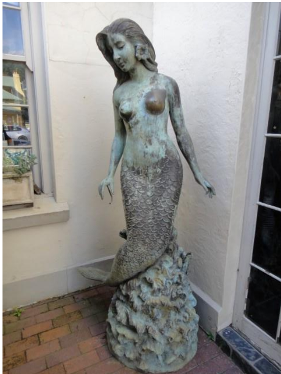
Image 46 – The Friendly Inn Hotel has some interesting bronze pieces adorning the entrance. This piece depicting a mermaid has a lovely green patina over it except where people keep touching it (have another look!).