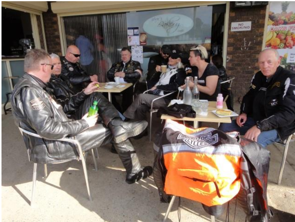
Image 22 – A short break with light refreshments will prepare us for the more challenging ride ahead through the famous “Barrengarry Bends”.