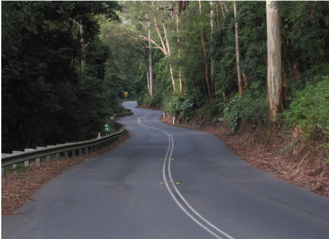
Image 34 – This road, being quite technical, forces you to take your mind off the day-to-day stuff and to fully focus on the tarmac ahead. It's a road that demands your focus.