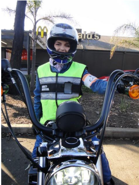
Image 16 – Its now 9.00 am and time to saddle up. We always run on schedule with all rides rekkied (done a reconnaissance of by our Road Captains) in advance of the ride to more accurately estimate travel times and road conditions.

Seen here is Belle who is a trainee Road Captain and our Chapter Youth Representative.