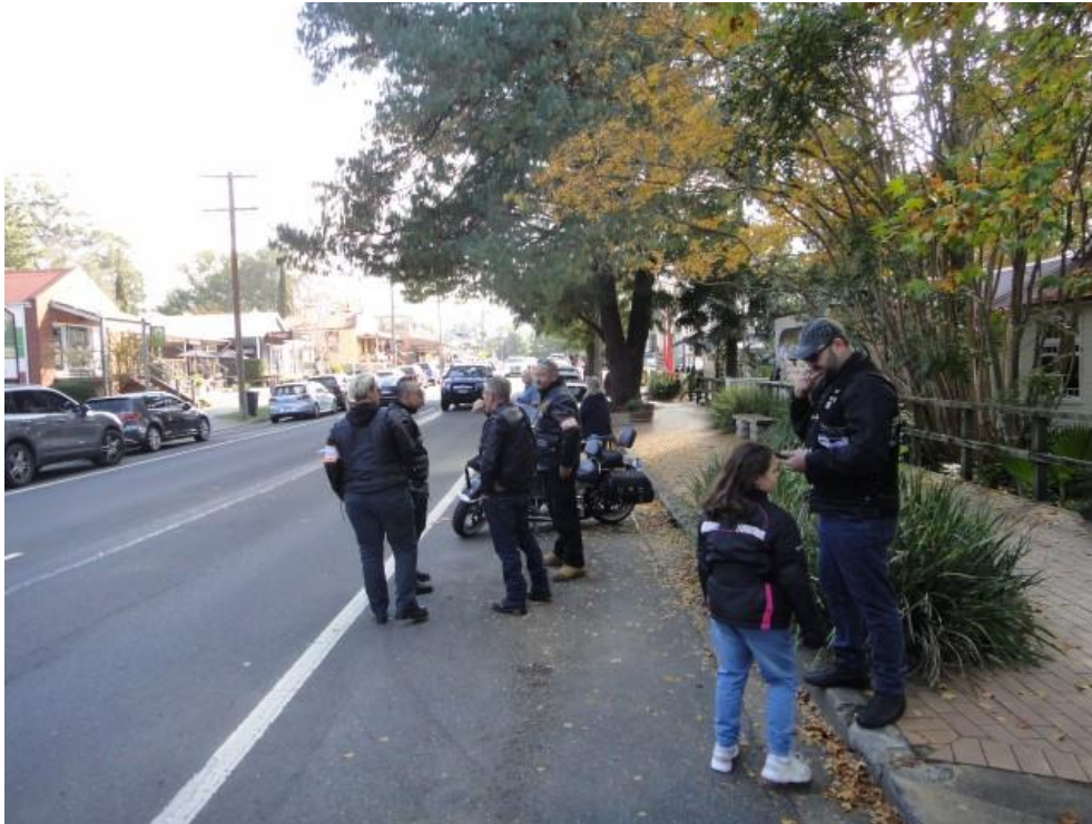
Image 42 – We regather before making our way to our lunch venue, The Friendly Inn Hotel.