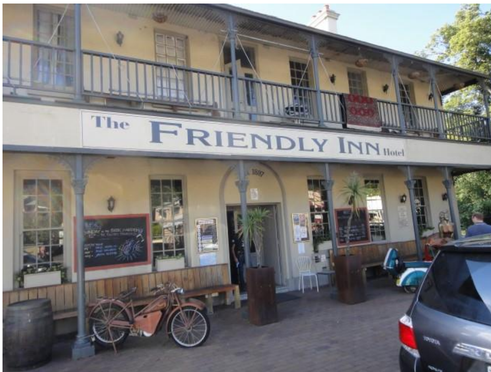
Image 45 – The Friendly Inn Hotel (formally known as The Commercial Hotel) was established in 1892.