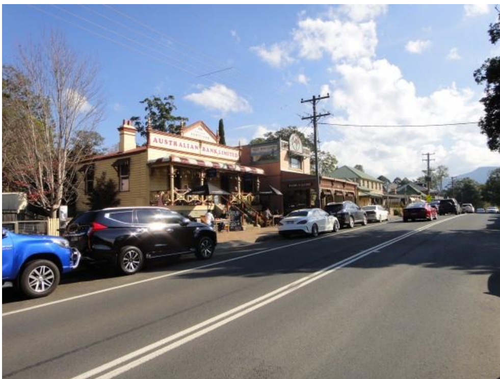
Image 43 – Another image of the town showing historic old buildings. Chic shops now line the main street.