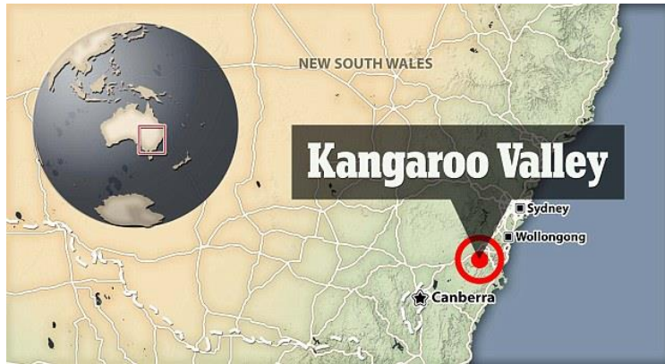
Image 1 – A map showing the location of Kangaroo Valley which is situated between Wollongong and Canberra in the state of New South Wales.