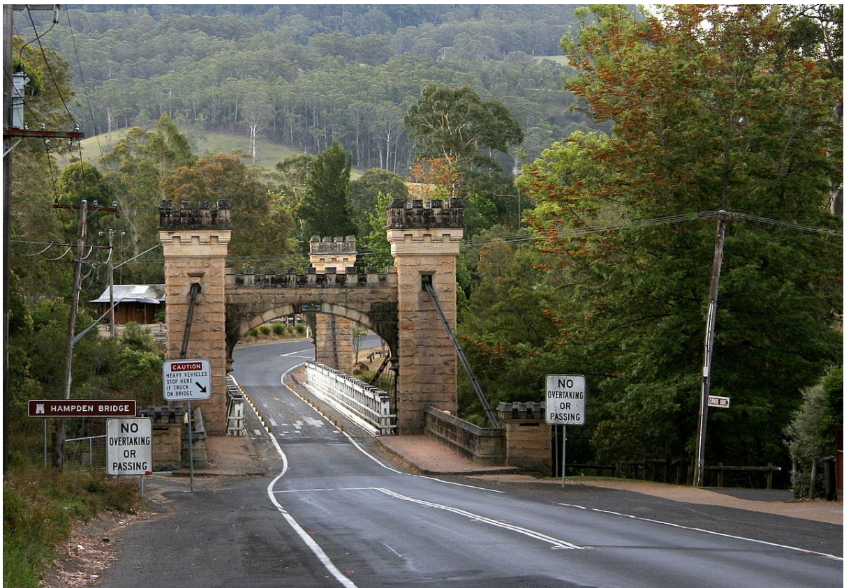
Image 37 – Having survived the Barrengarry Bends we now approach the town of Kangaroo Valley. Standing before it is this surprisingly spectacular bridge known as the Hampden Bridge which crosses the Kangaroo River. This Tudor-Gothic styled bridge was completed in 1898 and is a wooden suspension bridge, the oldest surviving suspension bridge in the country. It was restored in 2011 with great care being taken to replicate the original bridge rather than just replace it with modern technology.