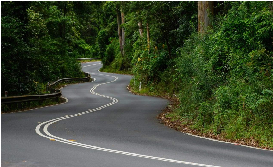
Image 35 – A ride through this valley is picturesque but not without its hazards. Despite its beauty, it potentially can throw just about every riding hazard in your path.