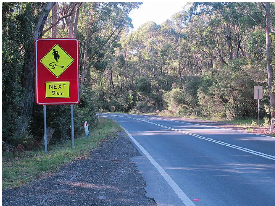
Image 31 – This sign will deter cagers (car drivers) but is inviting to motorcyclists. It advises a magnificent collection of corners await us!

Image 30 – After the sleepy town of Fitzroy Falls and before arriving at Kangaroo Valley we will experience a series of back and forth hairpins and long flowing bends known as the Barrengarry Bends that will keep us well and truly focussed. It is known as the Barrengarry Bends because the town of Barrengarry lies between Fitzroy Falls and Kangaroo Valley and this 16 km stretch of road is steep, spectacular and winding. We will be making the descent through the Barrengarry Mountain into Kangaroo Valley through spectacular scenery.