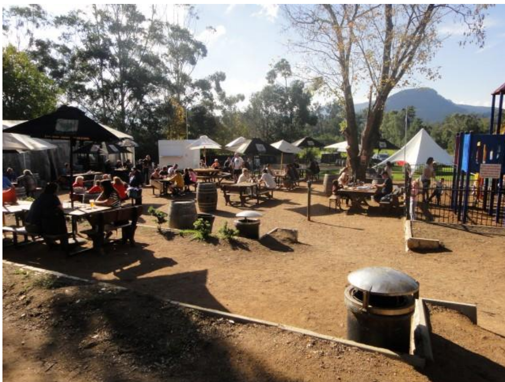
Image 49 – The back yard of the Hotel saw most patrons preferring to eat outside in the lovely warming sunshine.