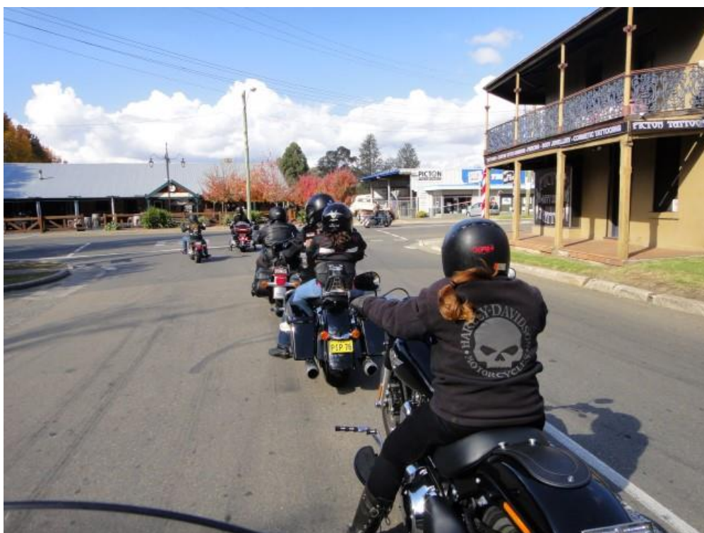
Image 29 – A shot taken at Picton on our way south. There was very little traffic found along our route today as we avoid the main highways preferring to use the more scenic secondary roads.