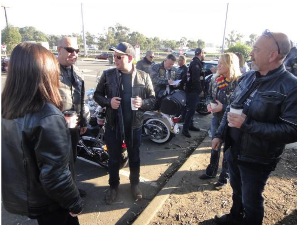
Image 5 – We see a mix of familiar and new faces today and the weather is perfect for a ride with temperatures in the low 20's Celsius.