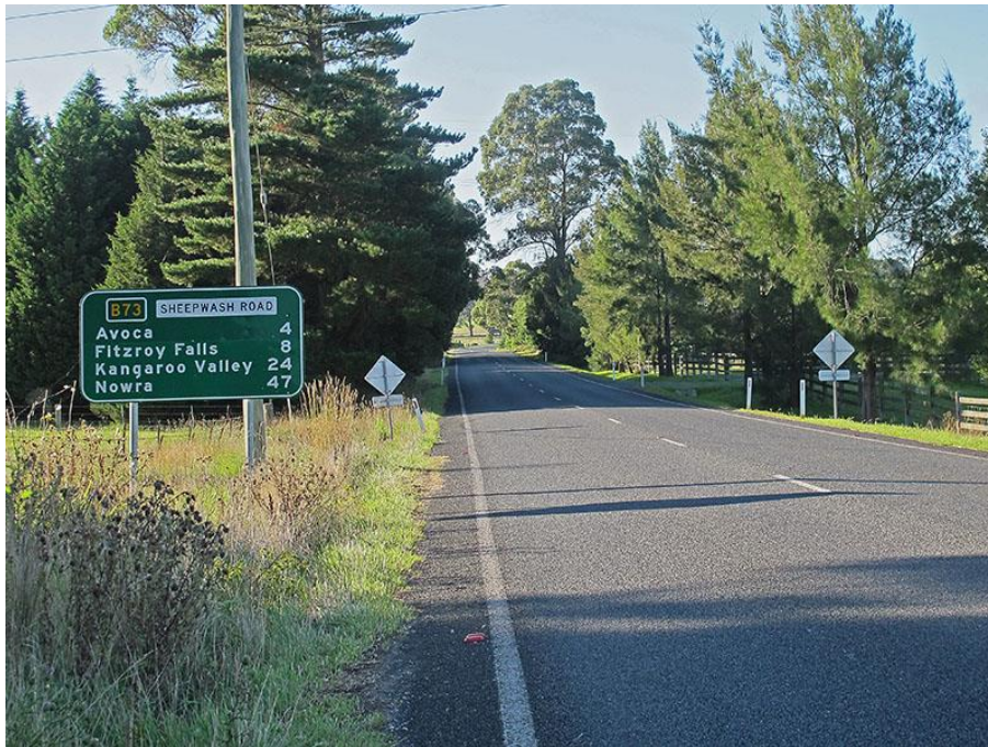
Image 30 – After the sleepy town of Fitzroy Falls and before arriving at Kangaroo Valley we will experience a series of back and forth hairpins and long flowing bends known as the Barrengarry Bends that will keep us well and truly focussed. It is known as the Barrengarry Bends because the town of Barrengarry lies between Fitzroy Falls and Kangaroo Valley and this 16 km stretch of road is steep, spectacular and winding. We will be making the descent through the Barrengarry Mountain into Kangaroo Valley through spectacular scenery.