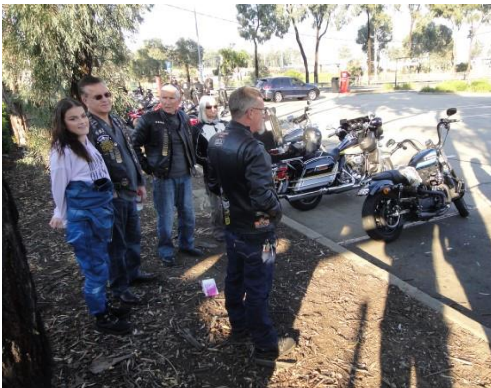
Image 4 – We start gathering at the meeting point from about 8.00 am. It's a nice time to catch up with fellow riders before the ride. The long morning shadows clearly announce the onset of winter.