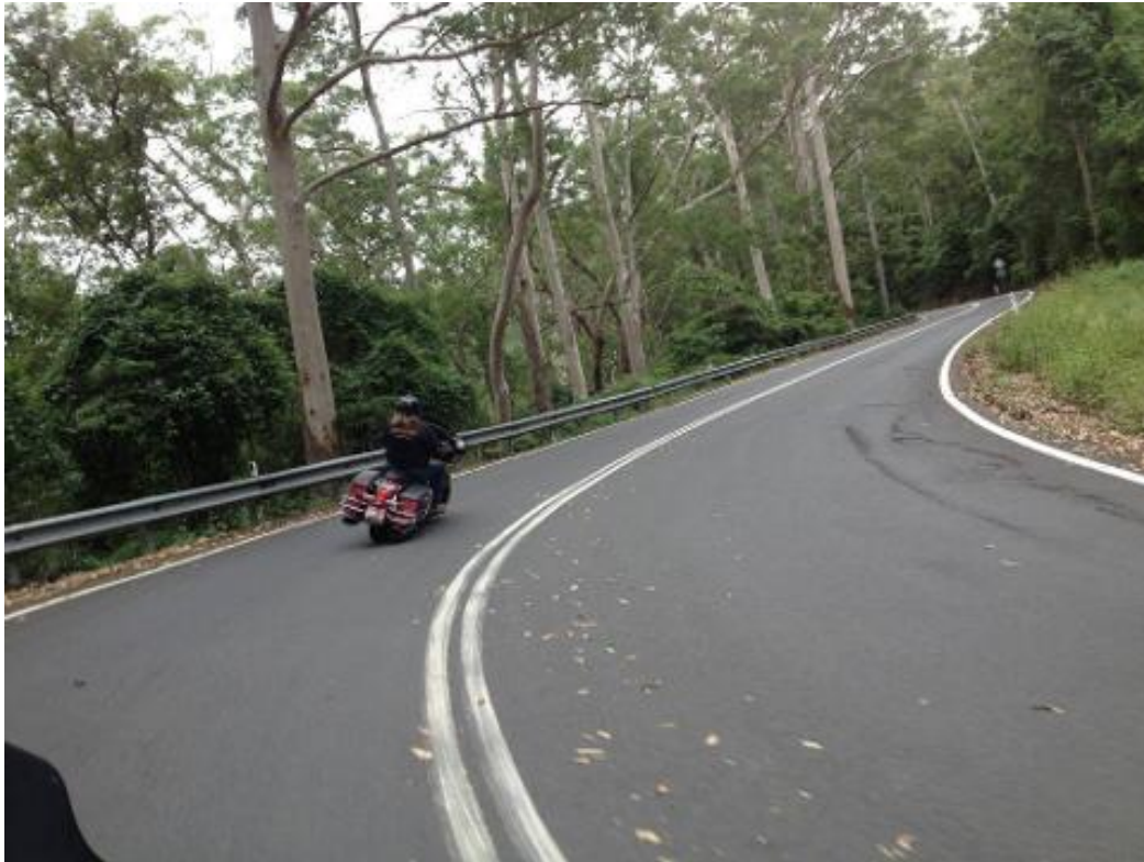
Image 32 – There are not many overtaking opportunities along the way and one must constantly be mindful of the abundant and unpredictable local wildlife present.