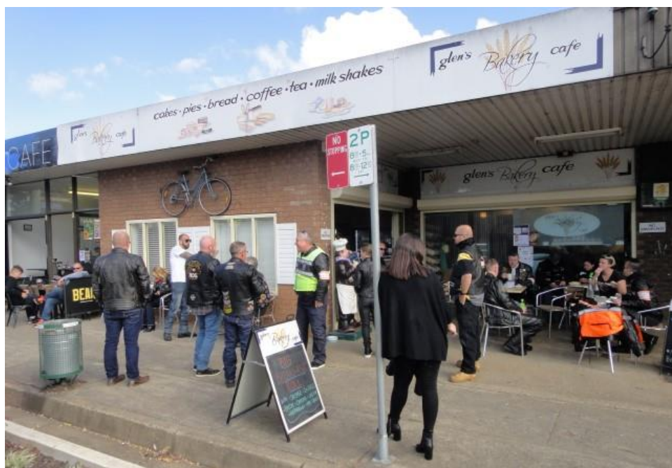
Image 21 – A view of us at Glen's Café. It's a very relaxed vibe with everyone getting on well including all the kids.