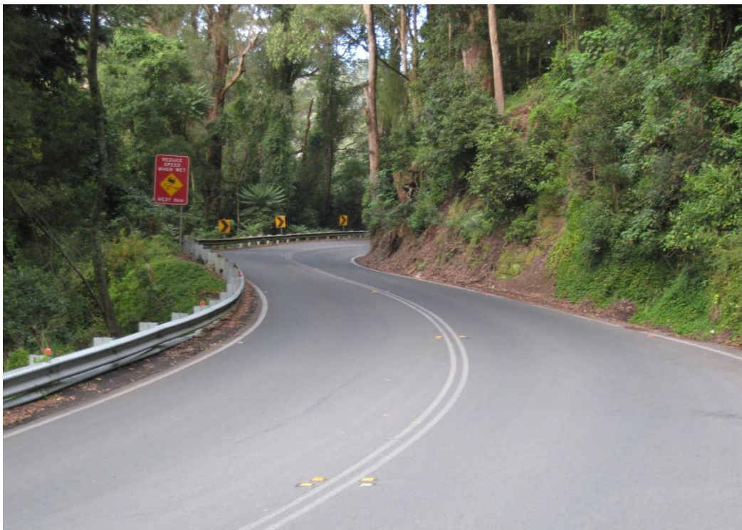
Image 33 – You won't ride every sweeping bend technically perfect but you get to try another bend right away.