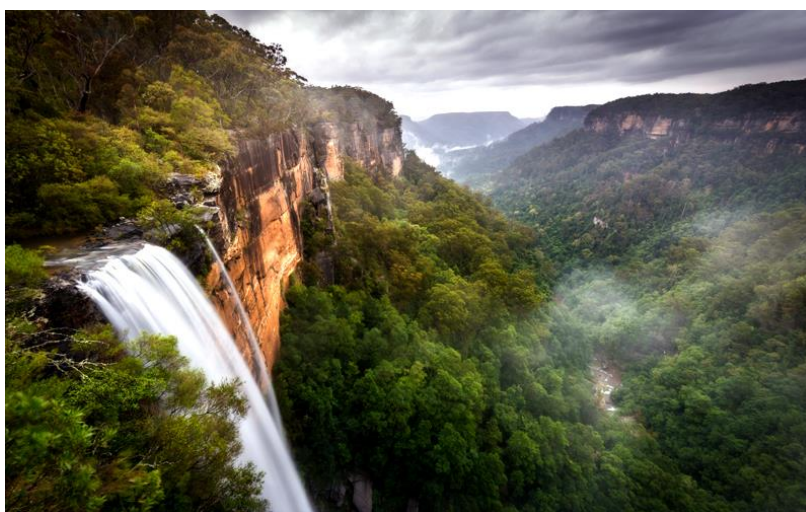
Image 3 – A downloaded image of the Southern Highlands featuring the Kangaroo Valley.