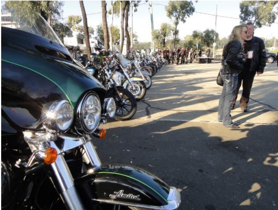
Image 6 – Here we see a splendid line-up of Harleys but not all of them are ours. In the background you can see another motorcycle group also meeting here this morning. They are the “Infadels MC” with whom we had very cordial conversations. We are all part of the motorcycle fraternity!