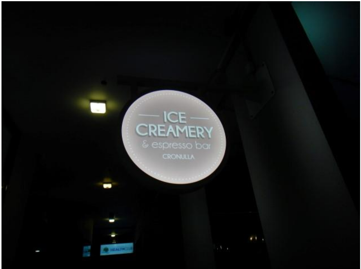
Image 14 – We head for the Ice Creamery opposite the carpark for refreshments.