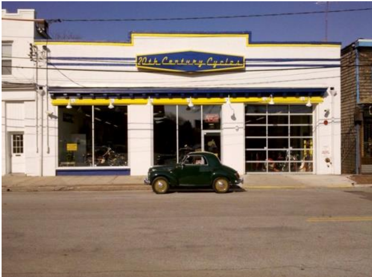
Image 5 – Joel's motorcycle gallery on Audrey Avenue transformed a decaying storefront to a gleaming showroom with the characteristics of a clubhouse/art gallery.