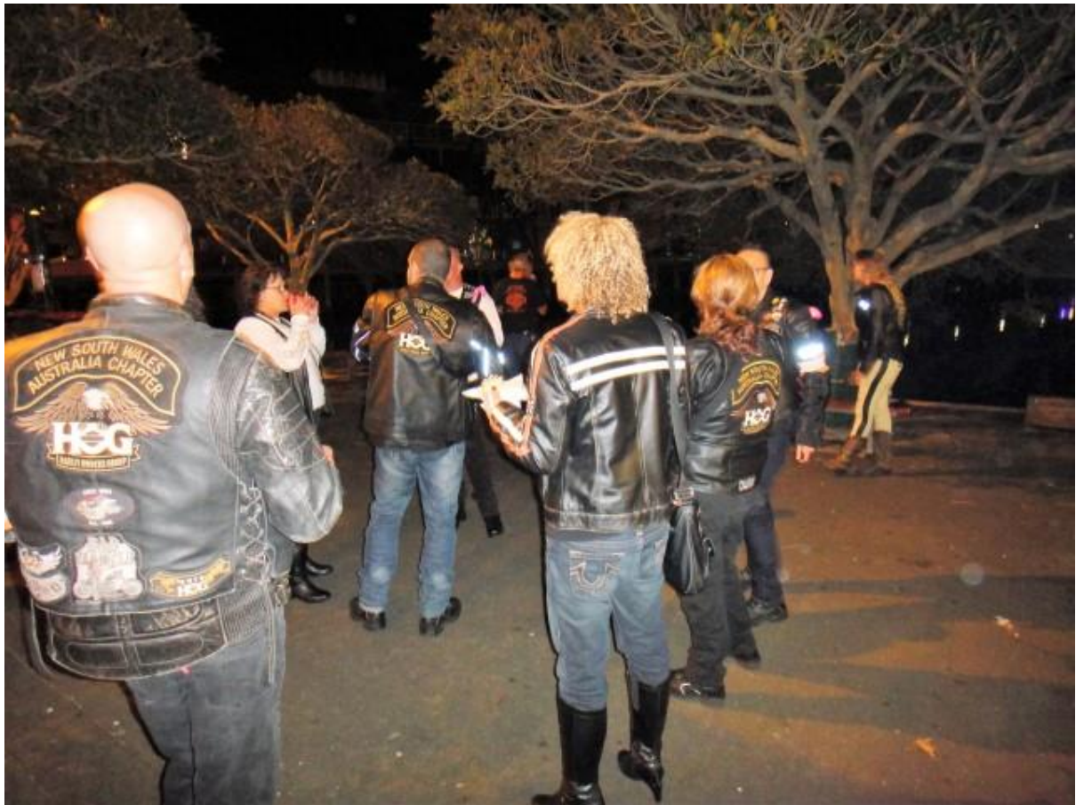
Image 28 – Next to Harry's is a wide footpath where we gather to eat, drink and be merry. In the background is part of Sydney Harbour with prestige apartments to one side and the Navy dockyards close by.