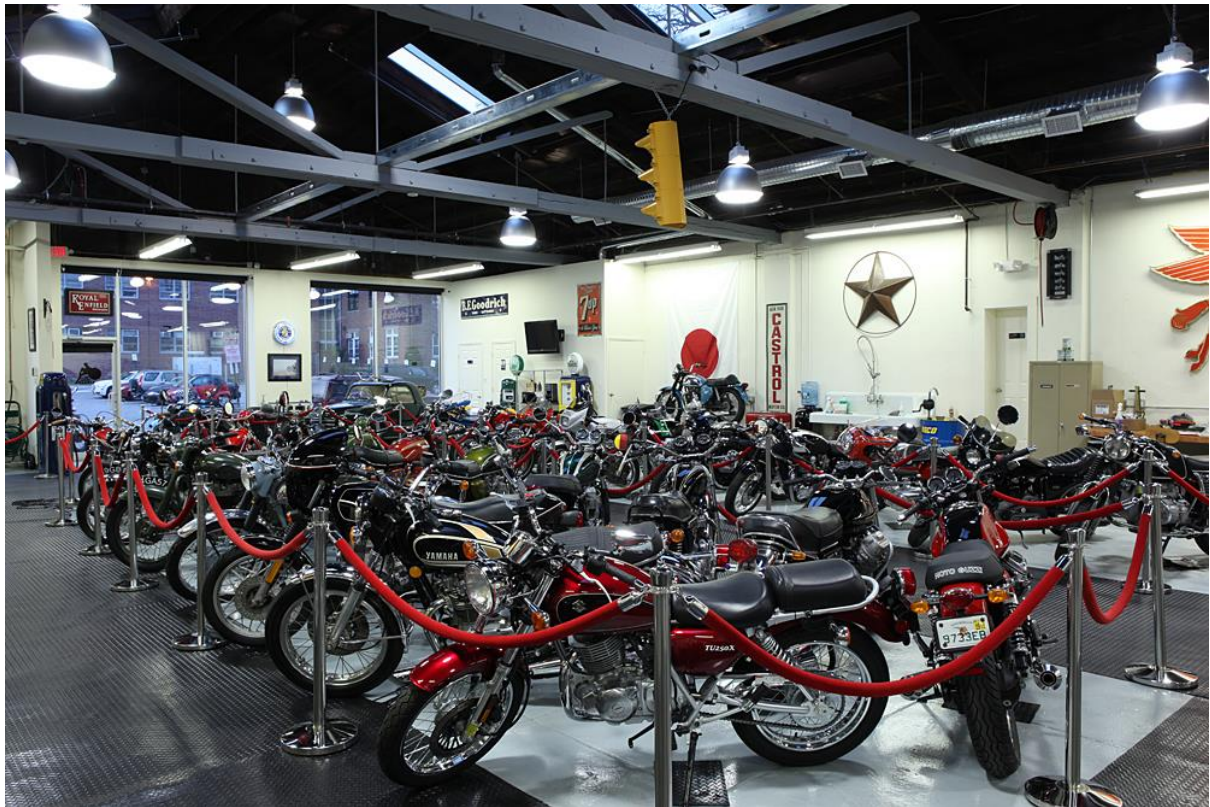
Image 9 – Joel's collection of over 90 bikes lined up in neat rows, includes all the top marques such as Harley-Davidson, Triumph, Moto Guzzi, BSA, Royal Enfield, Ducati, BMW, Honda Yamaha and others. They are all beautifully presented and are all registered and ready to ride.