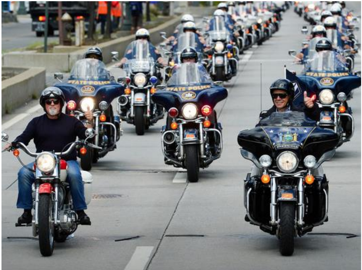
Image 49 – Billy Joel and New York Governor Cuomo lead the 9/11 Memorial Motorcycle Ride in New York on September 11, 2015.