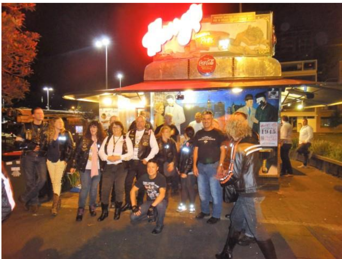
Image 34 – Before leaving Harry’s we take another quick group photo but not everybody is in it.

We now are headed north across the Sydney Harbour Bridge, making our way to Sydney’s northern beaches.