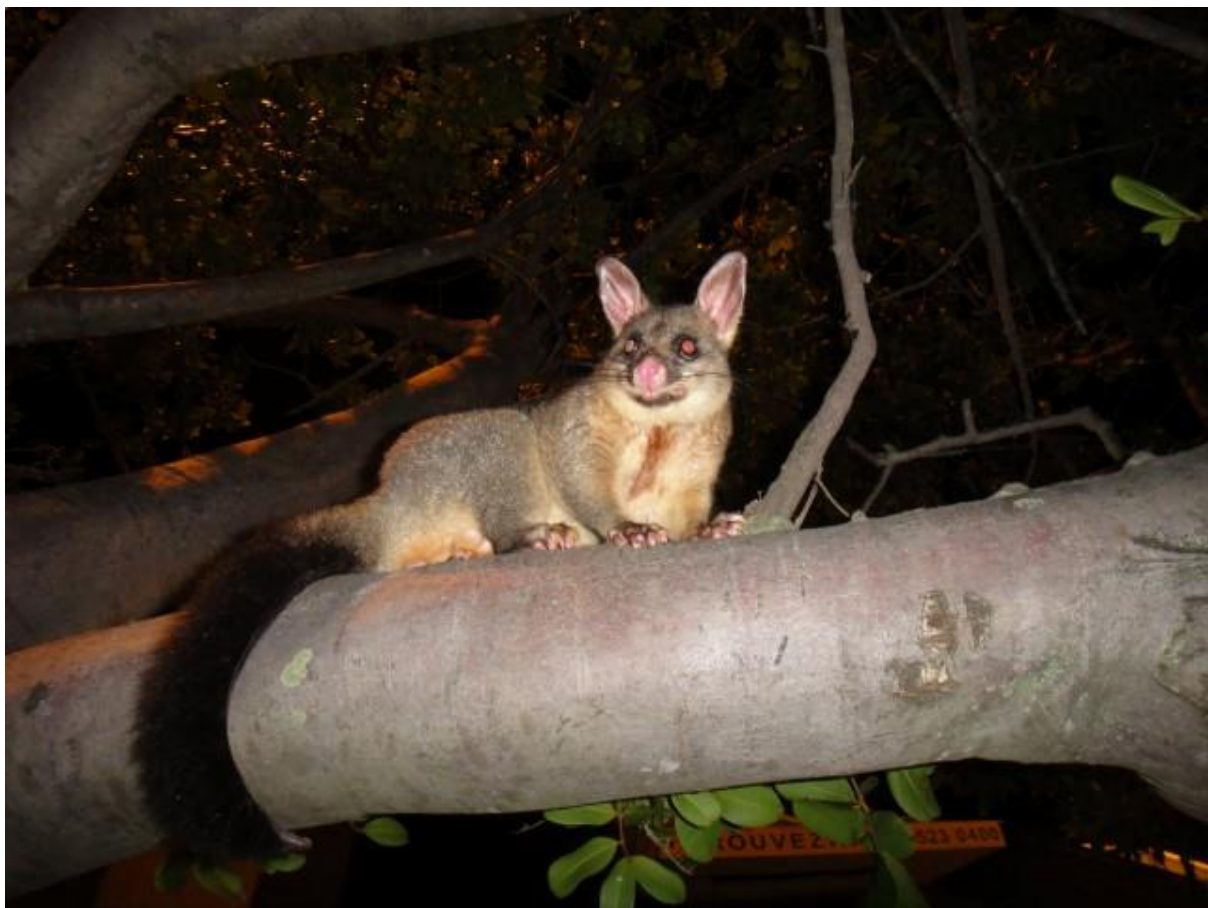
Image 12 – We arrive at our first destination at 1.30 am (Daylight Saving Time) in Cronulla, a beachside suburb south of Sydney. As we park our bikes in the carpark we noticed the possums had come down in their trees to check out our bikes.