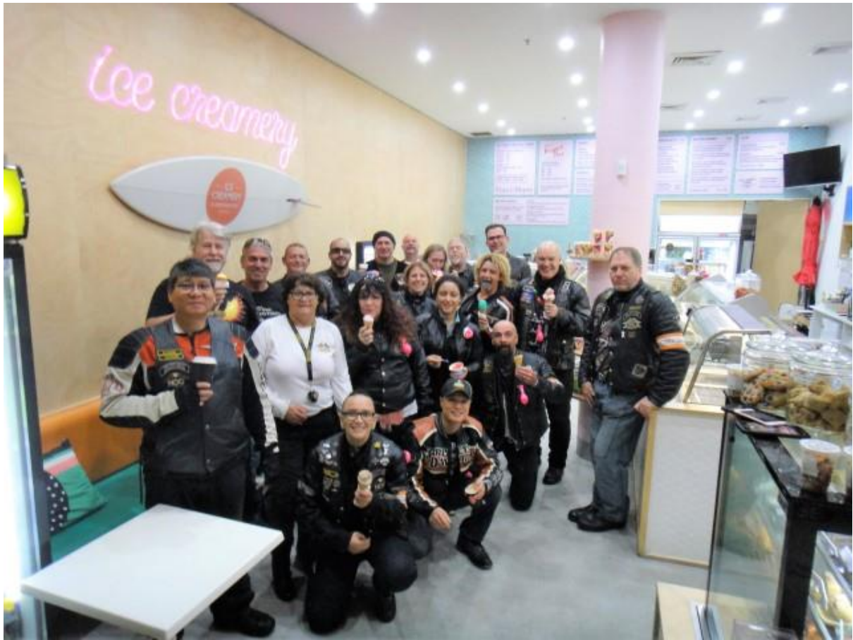
Image 18 – The shop staff happily takes photos for us with our cameras/devices and partake in our boisterous festivity. We are a lovable lot!