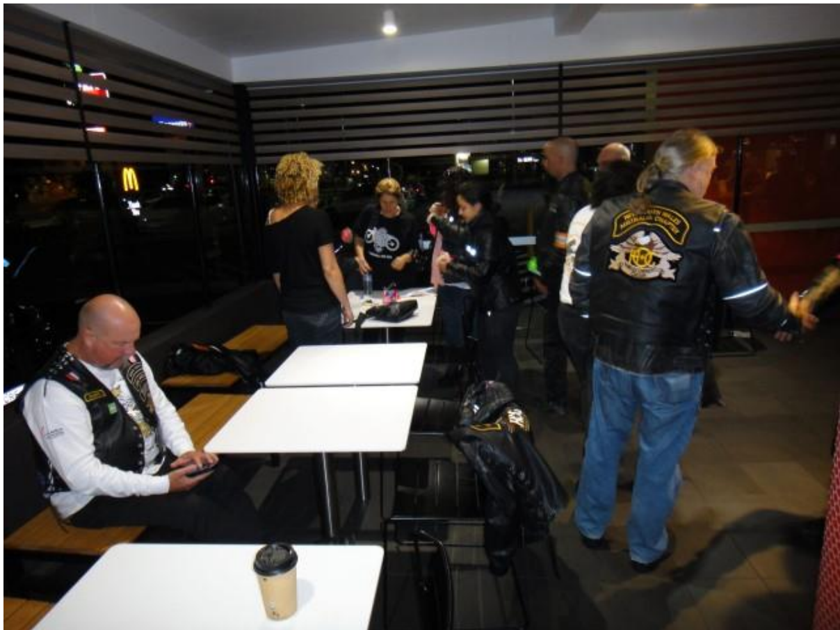
Image 1 – We meet at a McDonalds restaurant in Five Dock from 11 pm and watch the numbers grow. Today about 20 bikes will take part with a couple of additional pillion passengers.

This newsletter contains images taken on the day of the ride as well as downloaded images, mostly from Wikipedia and Google Images.