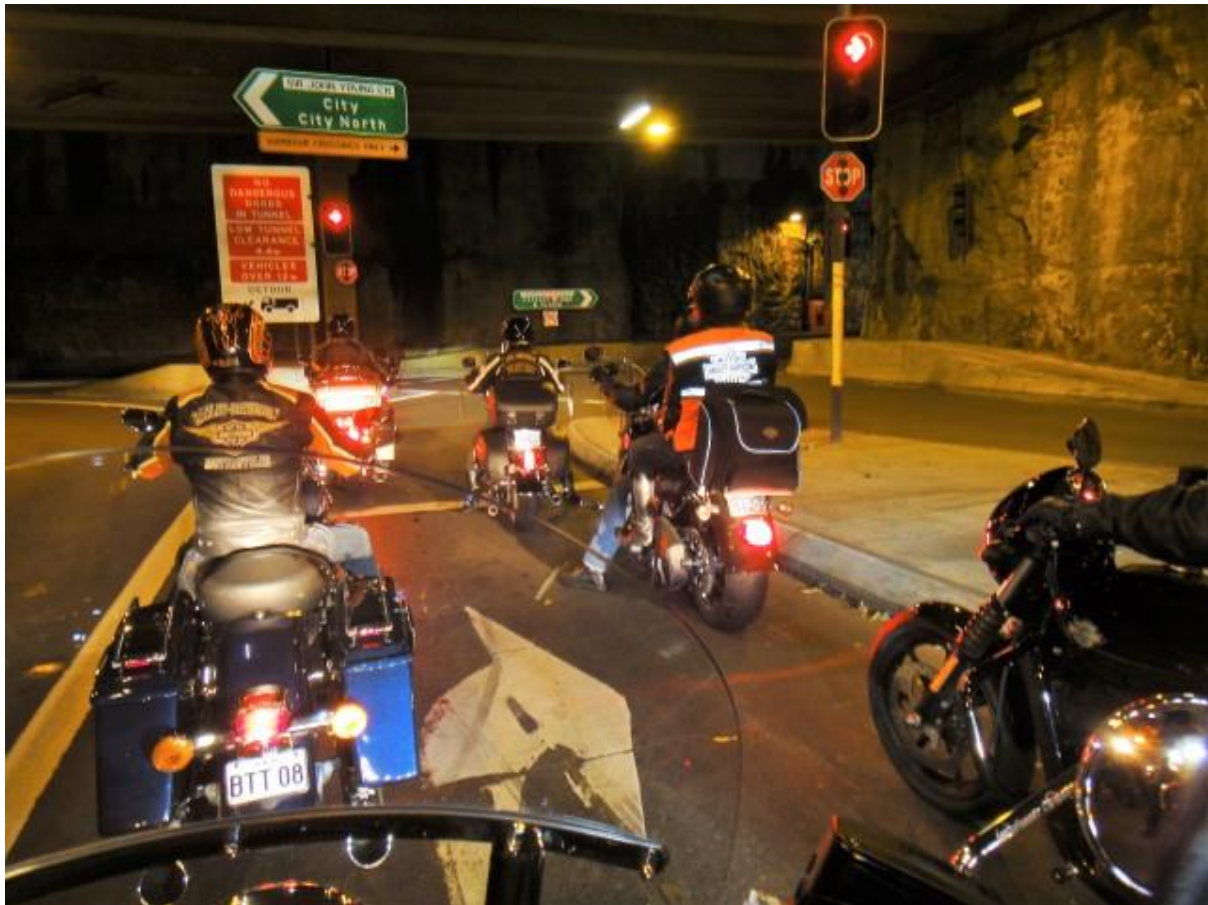
Image 36 – Not far from Harry's we make a turn towards the Sydney Harbour Bridge. There is no traffic about but we still have to stop at the red light!