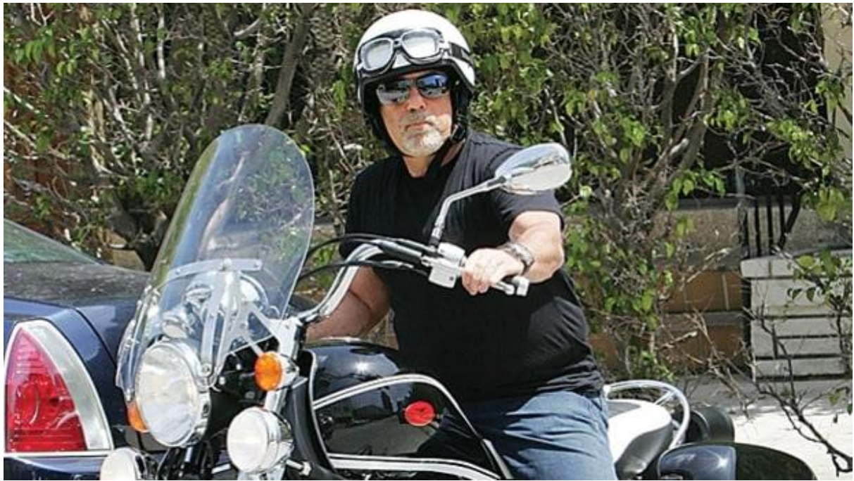
Image 41 – In August 1987, Joel did a live tour of the Soviet Union becoming one of the first American rock acts to play there since the Berlin Wall went up. These concerts were simulcast on radio around the world becoming the first live rock radio broadcast in Soviet history.