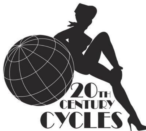
Image 3 – In November 2010, Joel opened a shop in Oyster Bay, Long Island, to house and exhibit his customised, retro-styled motorcycles. This motorcycle gallery named “20 th Century Cycles” is basically a place to exhibit his current motorcycle collection which is open to the public.

Born William Martin Joel on May 9, 1949 and known professionally as Billy Joel, he is a well-known American singer-songwriter and pianist. What is lesser known about Billy are his extra-curricular interests, particularly his love of motorcycles.