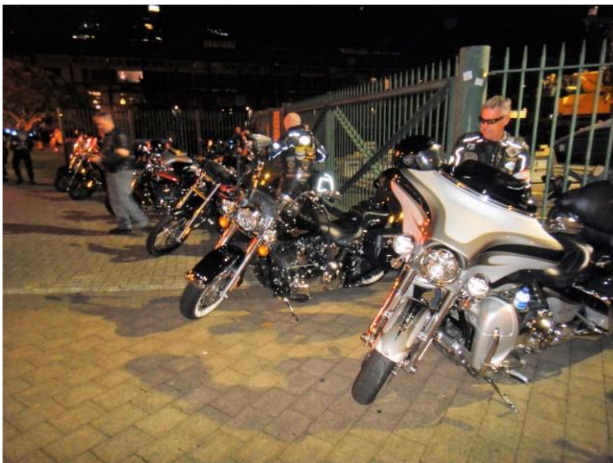
Image 22 – It's now 3 am and we arrive at our second stop in Woolloomooloo for a snack at "Harry's Café de Wheels". We need to keep our energy levels up for the all night ride.

Here we see some of our bikes, all very well loved and looked after. Nobody ever breaks down due to mechanical failure on our rides!