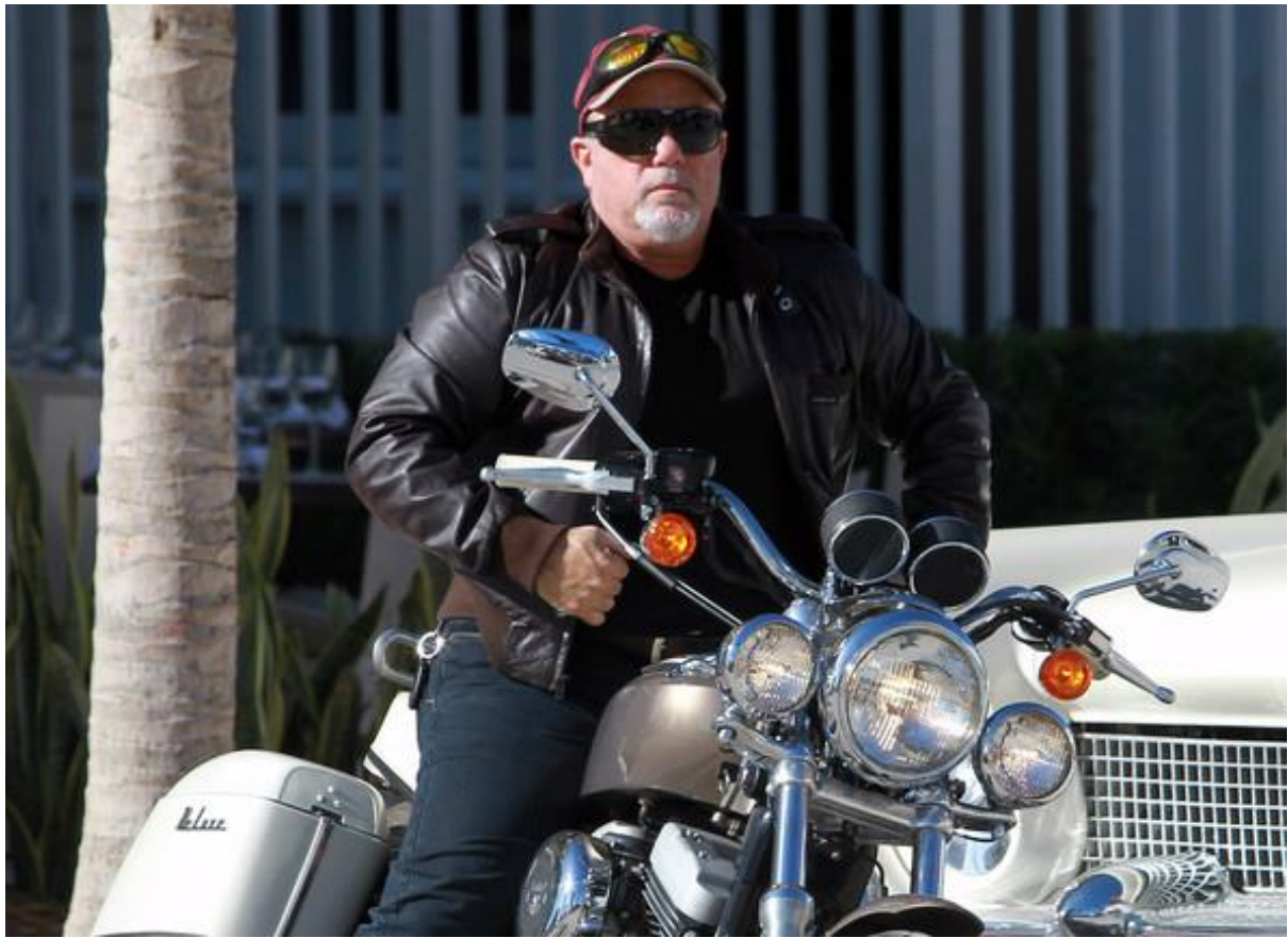
Image 31 – Joel, a secular Jew and an atheist, has been married 4 times.

After seeing the Beatles on the Ed Sullivan Show, Joel decided to pursue a career in music. In an interview he said of the group's impact, "that one performance changed my life.....up to that point I'd never considered playing rock as a career".