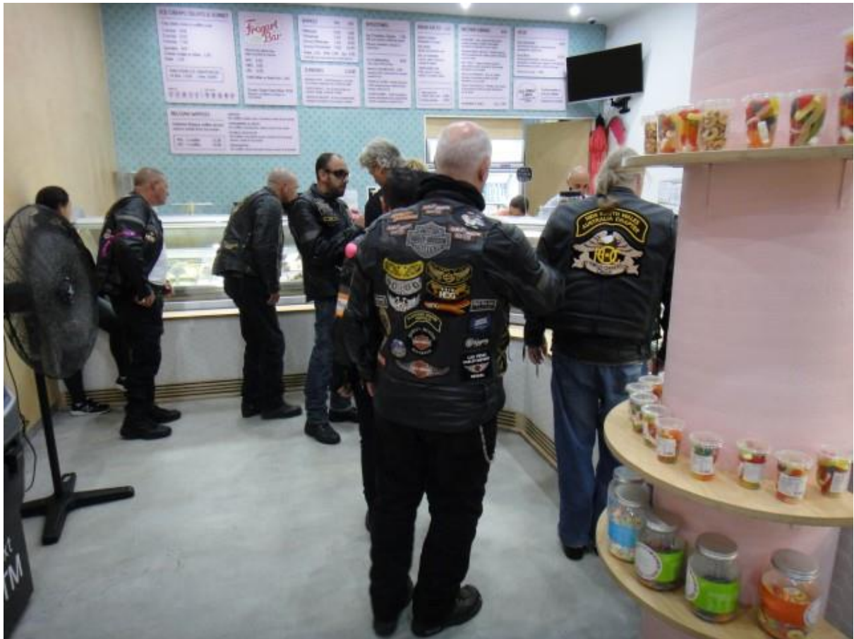
Image 16 – In the Ice Cream shop at Cronulla. Everybody loves ice cream and bikers are no exception.