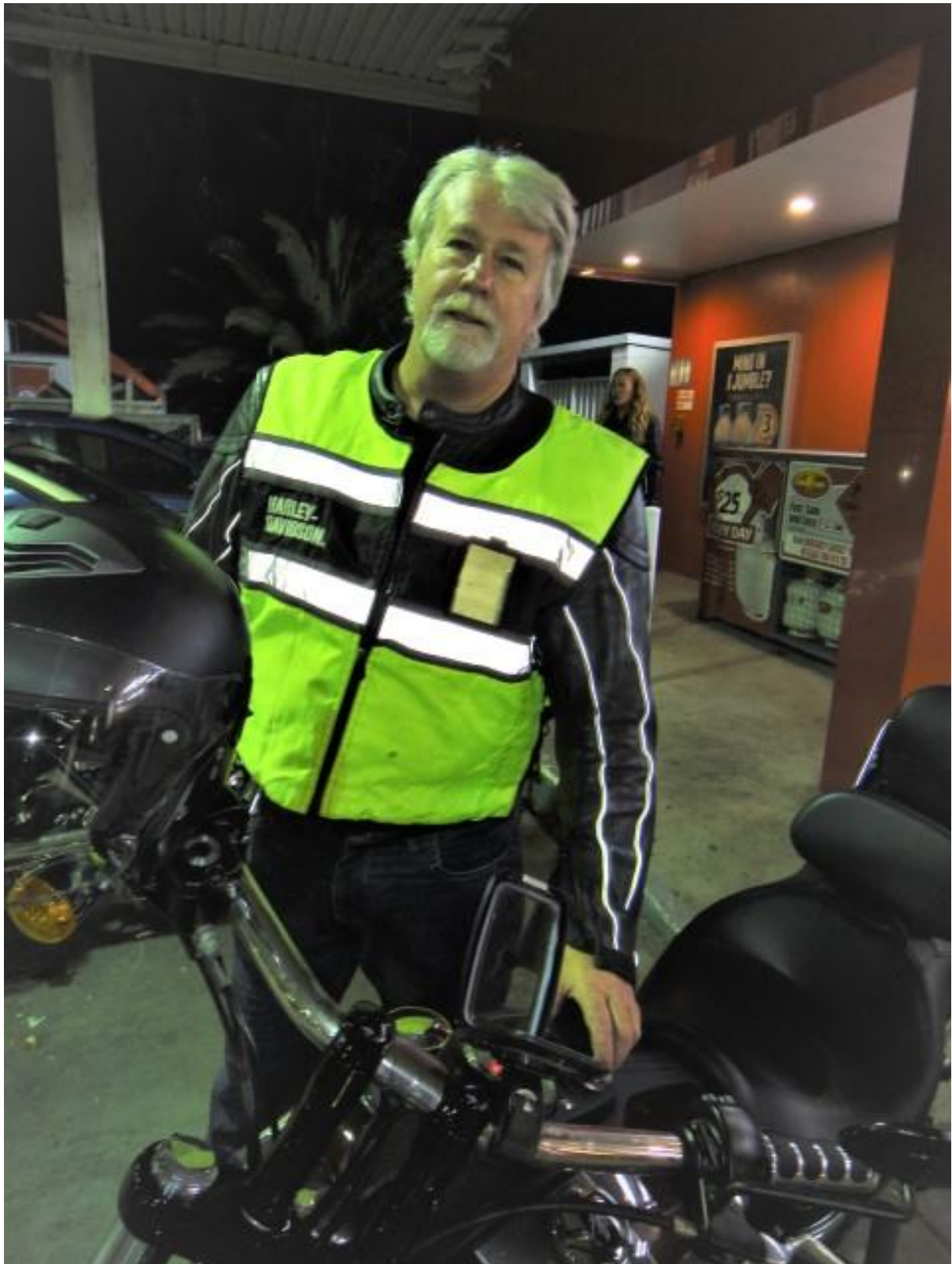
Image 44 – While at the servo we catch up with members familiar and unfamiliar.