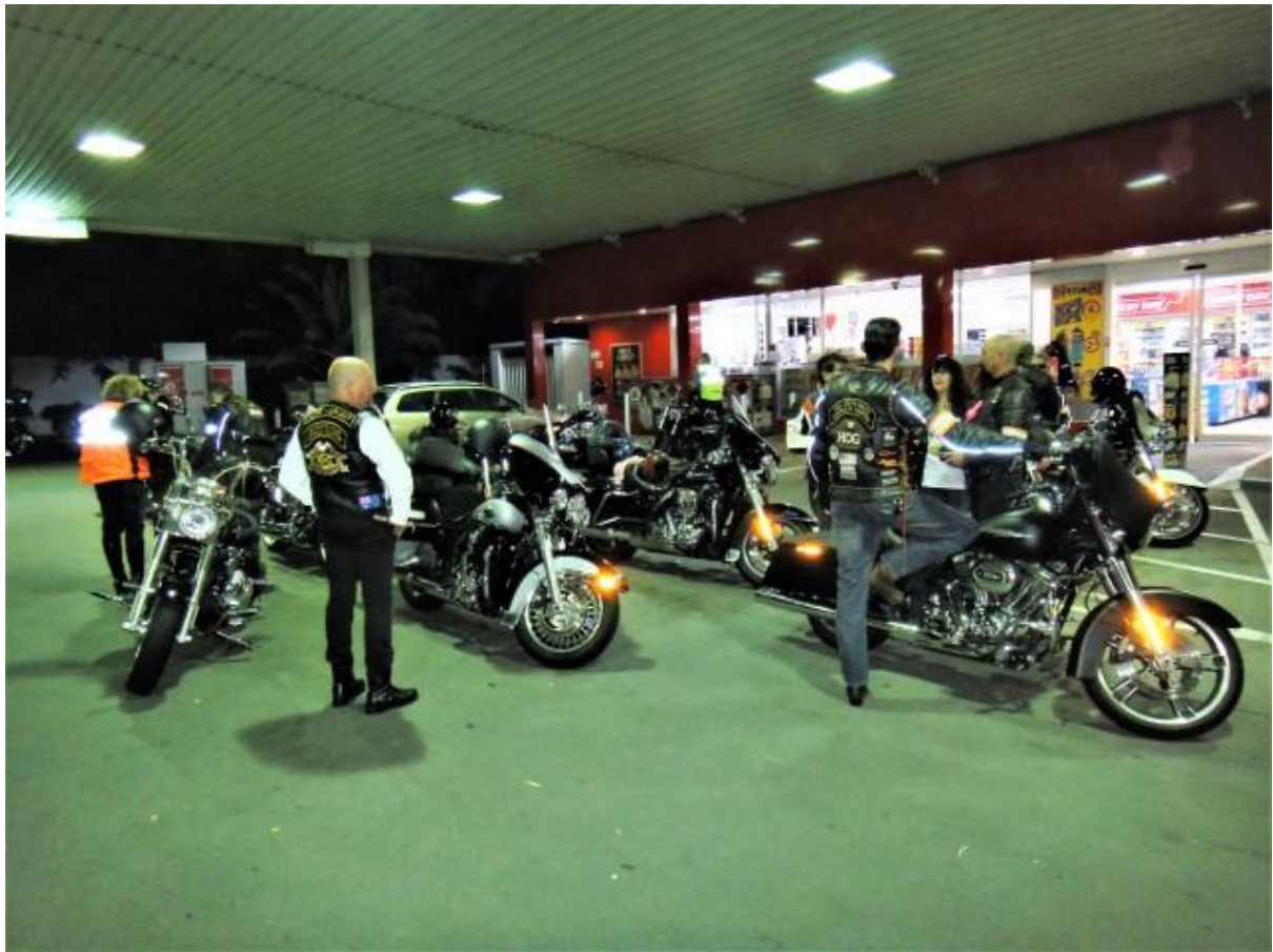
Image 42 – Our ride to the northern beaches ends at Avalon by which time we got to enjoy the many sweeping bends to get there. This roadway to the northern beaches is bumper to bumper traffic during normal hours. How sweet it is at 5 am on a Sunday morning!

We now stop at a 24 hour servo at Narrabeen on our way back to Sydney for more refreshments and a short break before going to our final destination for the ride, Kurnell for sunrise and brekkie.