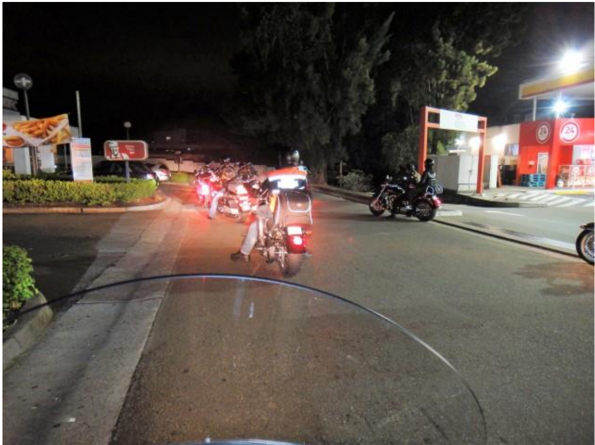
Image 10 – We finally head out for a ride after so many previously scheduled rides were cancelled due to unfavourable and extreme weather. Even tonight's ride was in question with heavy rain the whole week leading up to tonight. As it turns out, the weather for the ride was fine with minimum overnight temperatures only dropping to about 18 degrees.

Opposite McDonalds is a Shell servo (service station) where we can fuel up for the ride. It's preferable to commence the ride with a full tank and an empty bladder!