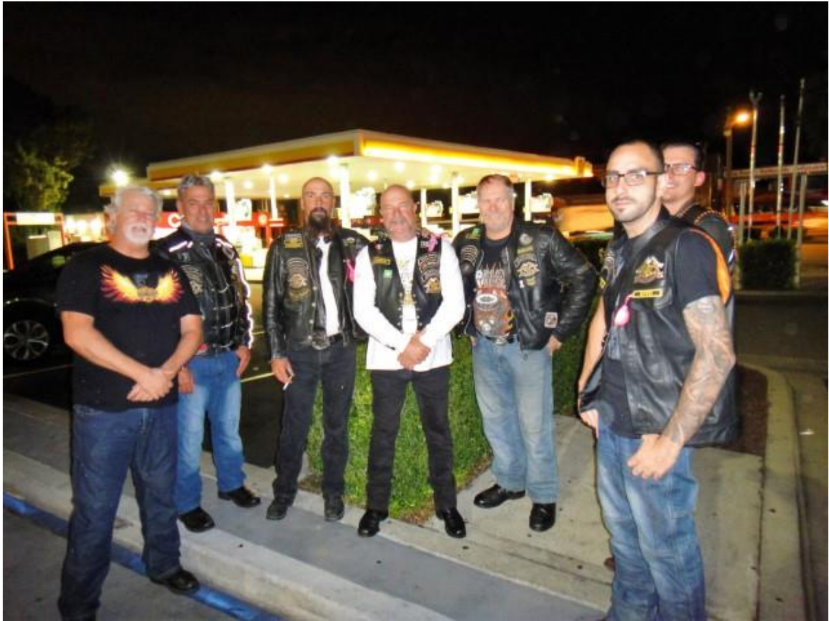
Image 6 – Departure time is looming and the road captains gather for their ride briefing. A ride is put together at the suggestion of a road captain who would have thoroughly researched the route and proposed it to the group.