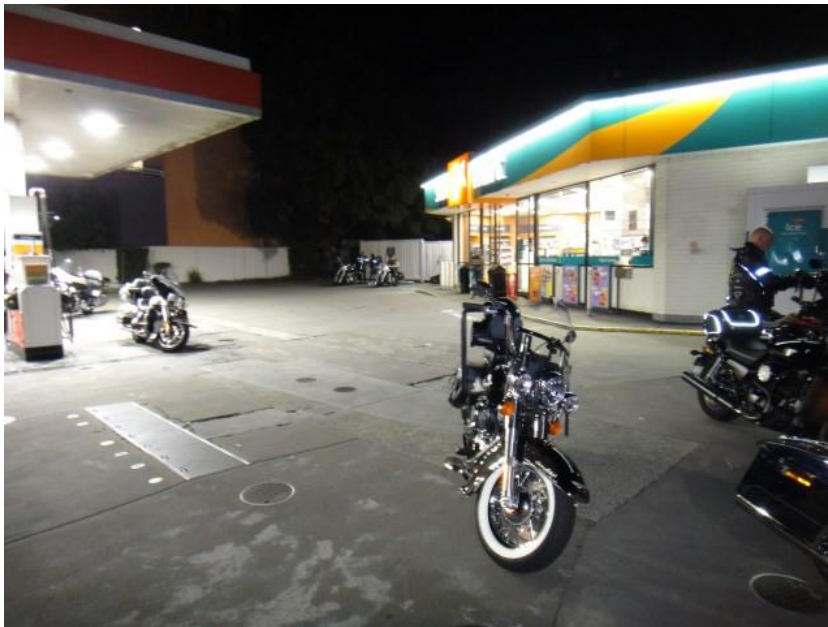
Image 38 – Now 4 am. On our way to the northern beaches we stop at a servo for the splash and dash (toilet stop). The solitary station attendant is most obliging and we are also thankful as there were no facilities back at Harry's. Perhaps the Lord Mayer of Sydney could look into this lack of public facilities at Woolloomooloo!!

We spend about 30 minutes here giving everyone plenty of time to freshen up.