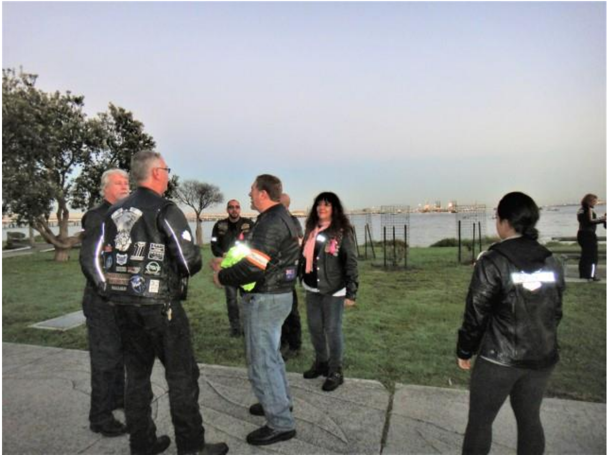
Image 56 – Well we saw the sunrise and now for some brekkie at the nearby café, the Endeavour café.