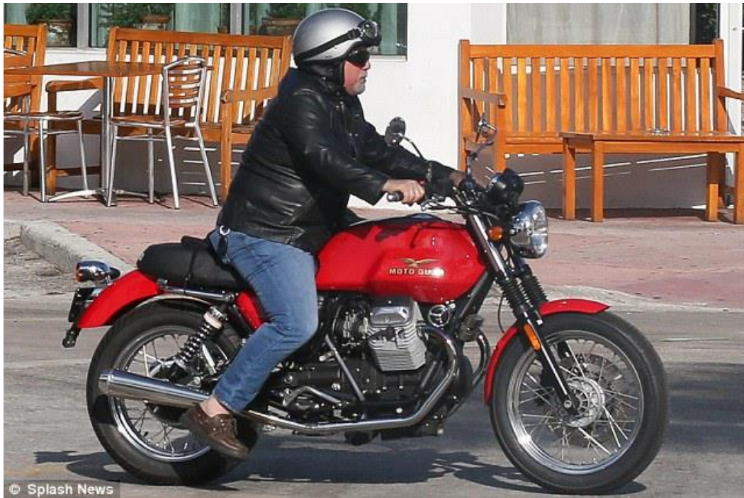
Image 25 - Joel's collection also includes special interest bikes such as the lead Police Moto Guzzi used at Grace Kelly's wedding in 1956 where she married Prince Rainier III of Monaco (not shown in above image).