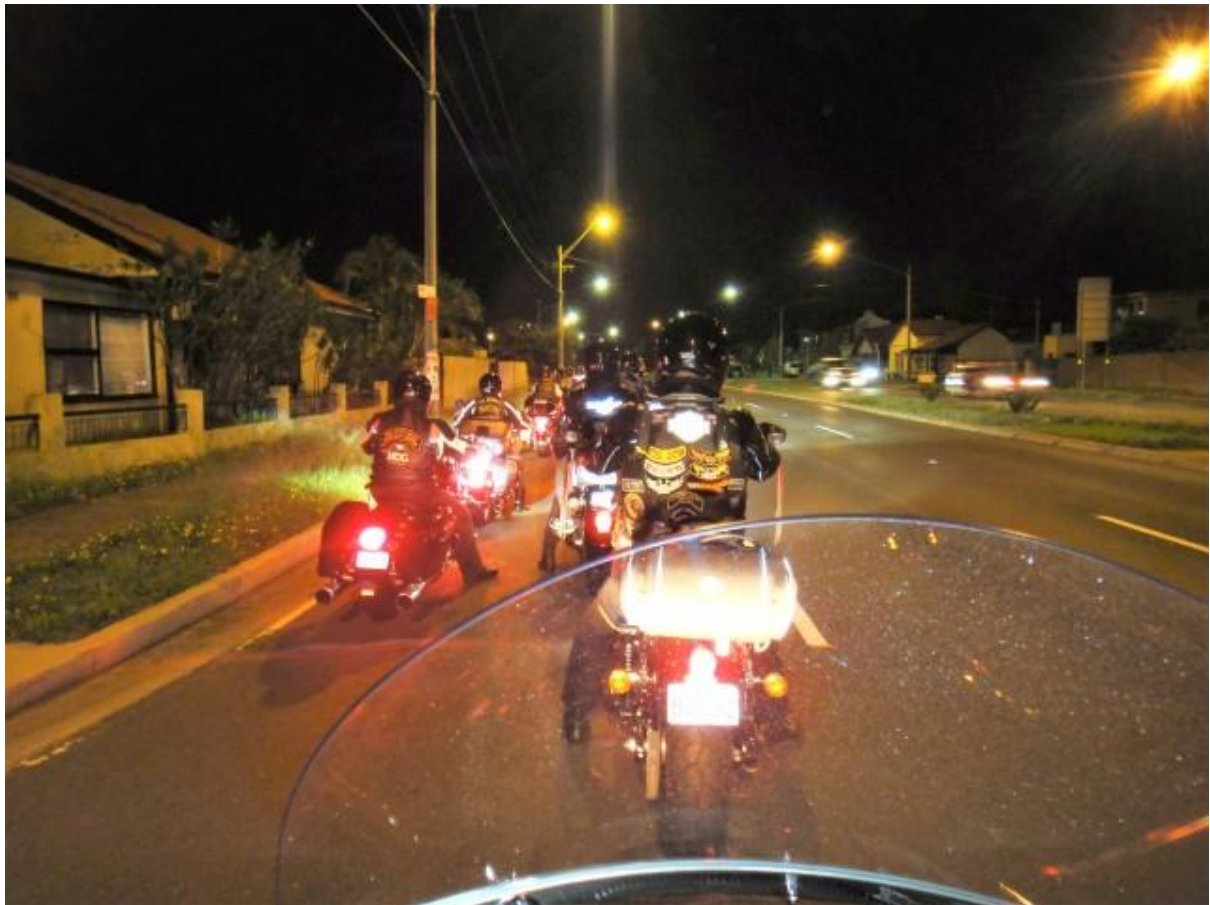
Image 50 – On the ride from Narrabeen to Kurnell we encountered many bicycle groups heading out for their Sunday morning ride, doing their thing.

Before approaching Kurnell we regroup so as to complete the ride together. It's impossible for the group not to be split up when travelling through countless sets of traffic lights. Also, travelling right across Sydney as we did tonight makes you realise how Sydney roads are now infested with speed and red light cameras. We do our best to help each other out by pointing to the camera as we approach so that anyone following is aware, and they in turn will point it out to the following rider.