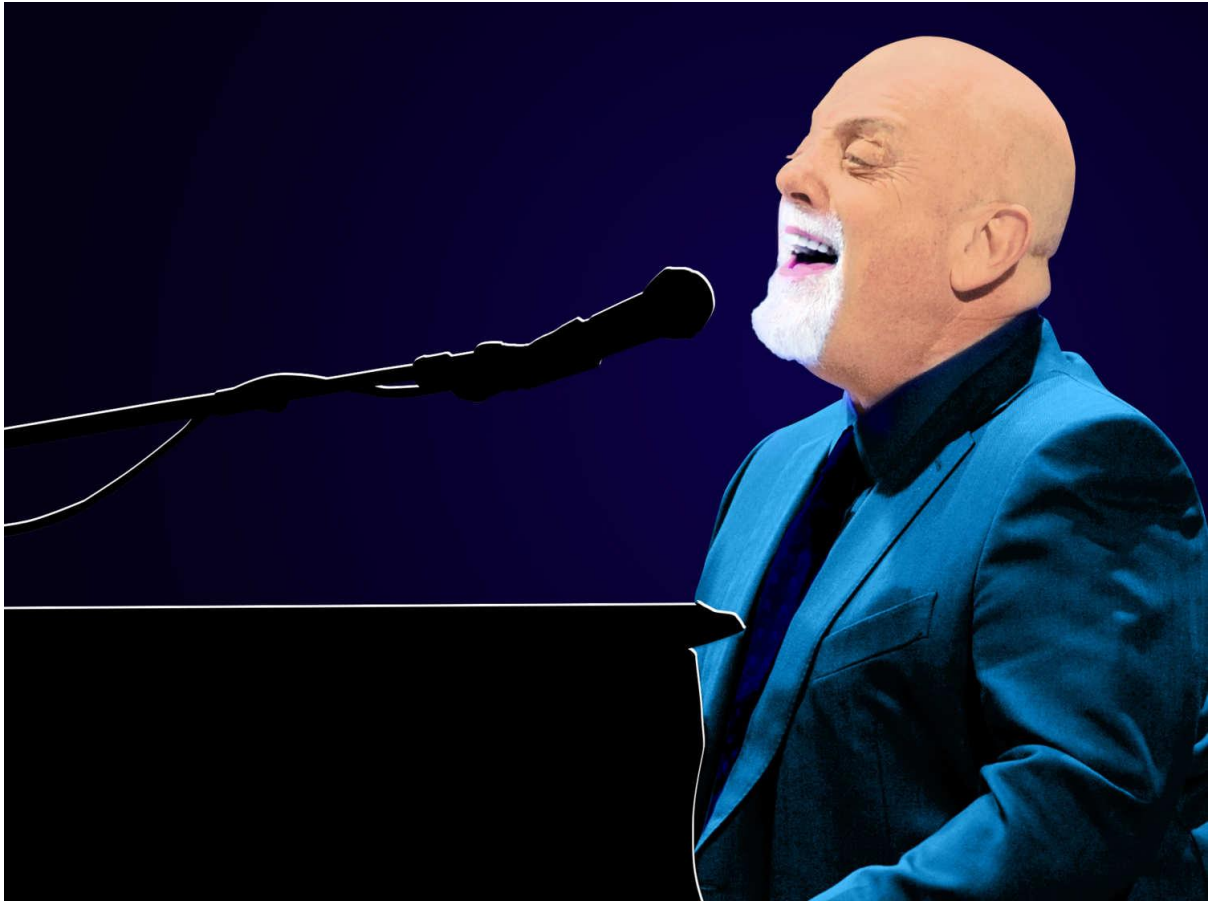
Image 59 – A more recent image of Joel performing at the Madison Square Garden.

Joel had top 40 hits in the 1970's, 1980's, and 1990's, achieving 33 Top 40 hits in the US, all of which he wrote himself. He is also a 6-time Grammy Award winner who has been nominated for 23 Grammy Awards. He has sold more than 150 million records worldwide, making him one of the best-selling artists of all time.