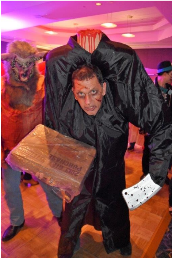
Playing hard at H.O.T. After party..