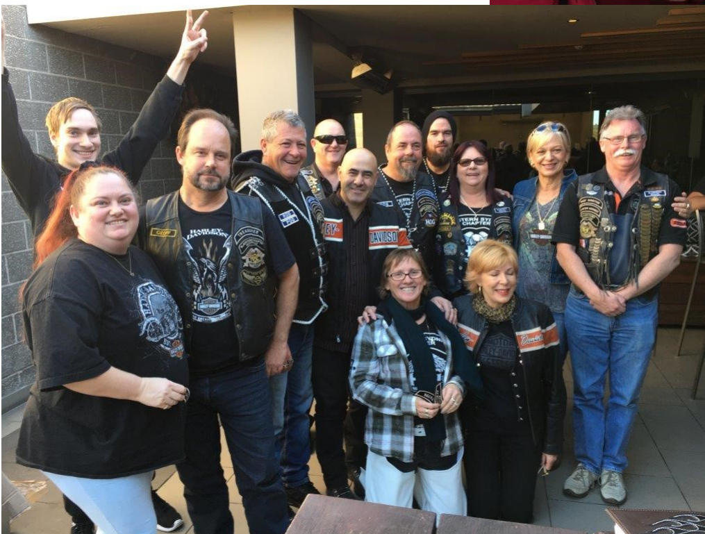
New team at Western Sydney