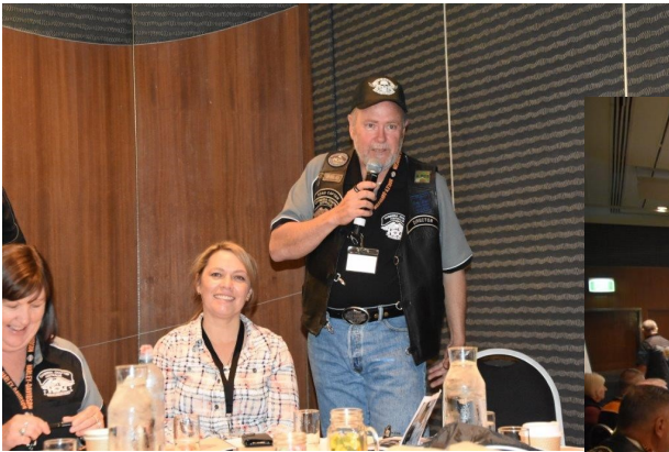
Working hard at H.O.T.