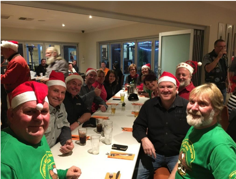
XMAS in July