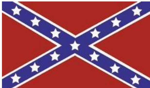
Image 33 – The battle flag of the Confederate States of America, also known as the Confederacy. This flag originally came into use at the time of the American Civil War (1861 – 1865). It is also referred to as the Civil War Confederate Flag, Confederate Flag, or rebel flag.

Today the Confederate flag is recognised as a symbol of the south but its use is controversial. For many Americans it is a representation of slavery, white supremacy, disunity and even treason.