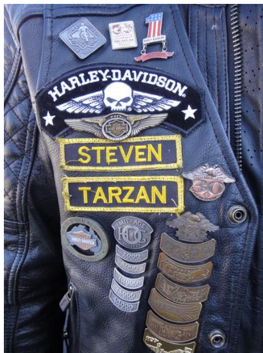
Image 8 – Let’s check out Tarzan’s vest! A HOG vest can show a great variety of pins and patches and are assembled however the wearer wishes. These adornments can express attitudes, display role, show affiliation, commemorate events, or can be simply for decoration. There are very many options but the vest does tell a story about its owner.

Here on the right breast we see Harley-Davidson and HOG content pins. That column of pins below the letter Z are HOG mileage pins earned whilst on HOG adventures. We see that Tarzan has completed at least 40,000 miles on HOG adventures. That next column of bronze coloured pins are HOG annual membership pins. At top left we also see that Tarzan has undertaken a rider safe skills course.