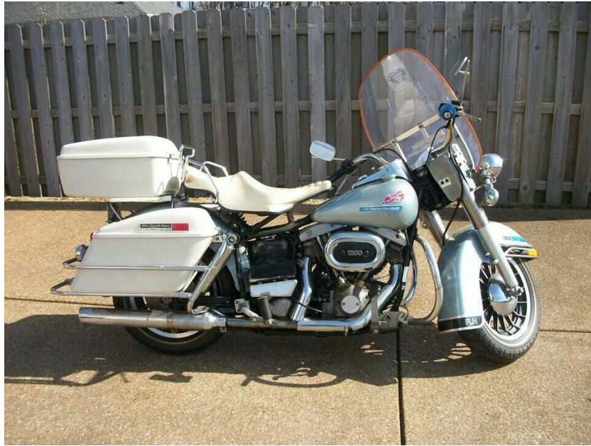
Image 32 – Confederate Edition bikes consisted of a special commemorative paint scheme of metallic grey paint and 'rebel' flag decals on the fuel tank, and an army general's sleeve braid on the front fender. They would be the least known models in the company's history.