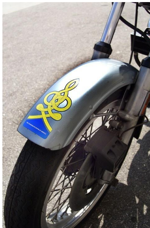
Image 37 – This is the general's sleeve braid on the front fender of Confederate Edition bikes. The writing below the braid says "The Confederate States of America".

While it is suggested that Harley-Davidson pulled the Confederate Edition for political reasons, poor sales were probably the true motivation. In vogue or not, the rebel motif was only going to appeal to a small segment of the public.