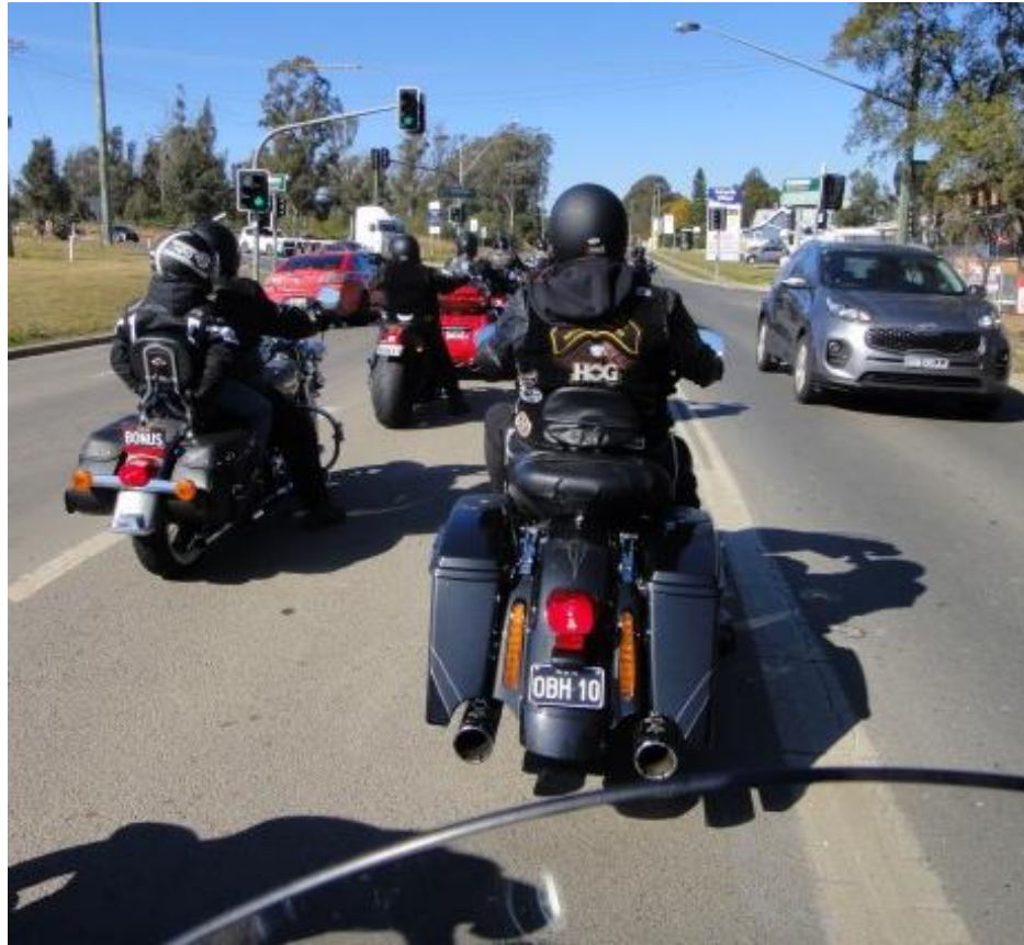
Image 21 – We continue on through rural areas towards our destination.