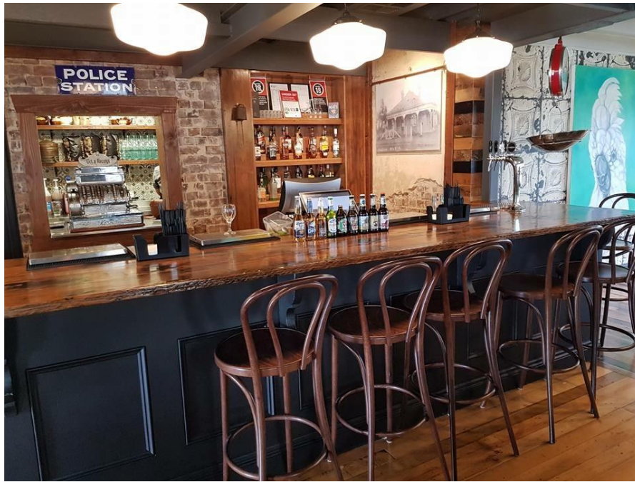
Image 29 – There is some Police memorabilia inside the restaurant. That's because this building served as the Mulgoa Police Station from the early 1900's to 1934.