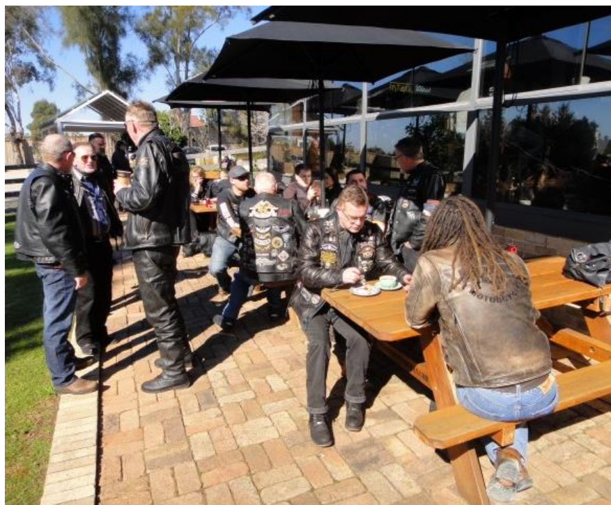
Image 30 – We choose to eat outdoors soaking in the warming winter sun. Blue skies with temperatures around 20°C and no wind made it very pleasant indeed. Its midday and you can tell its winter by the long shadows.