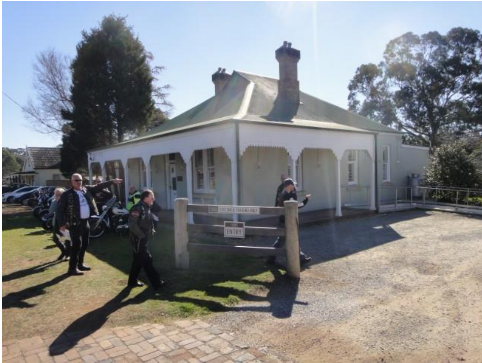
Image 23 – We arrive at our destination around 11.20 am after a very pleasant 75 km ride. Unlike city venues there are plenty of parking spaces available to us here.