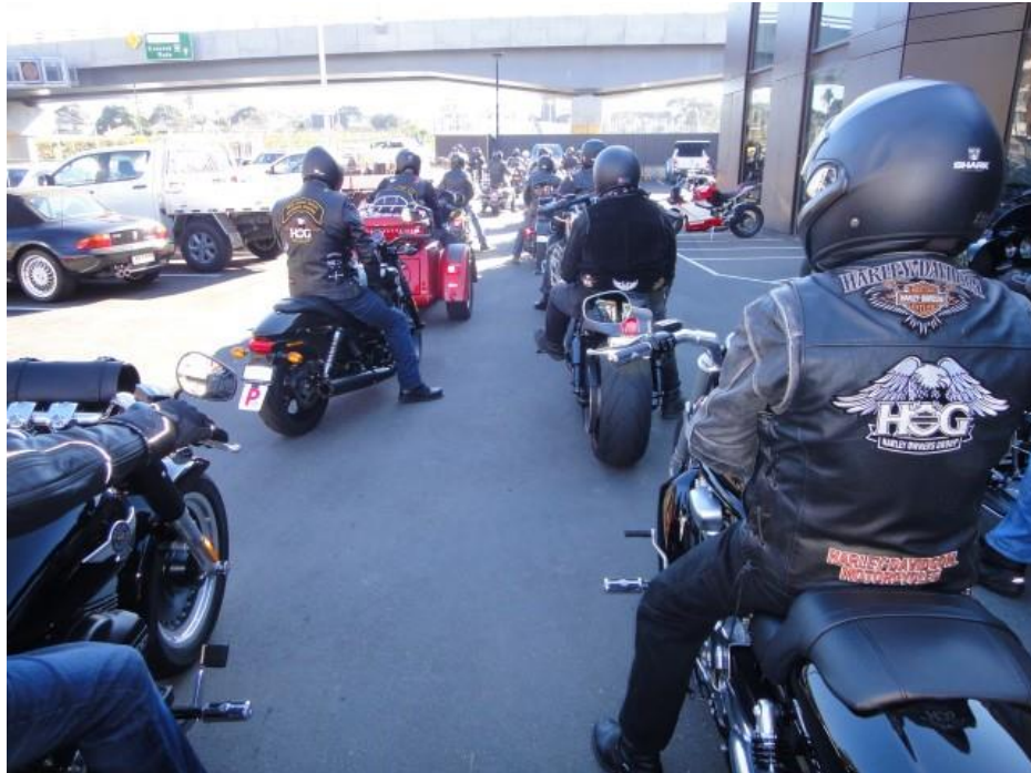
Image 15 – Here we are in Fraser's carpark before departing en masse. Launch is delayed until we see a suitable break in the traffic on the very busy Concord Road. Then a Road Captain obstructs traffic flow allowing us all to leave together in one cohesive group.