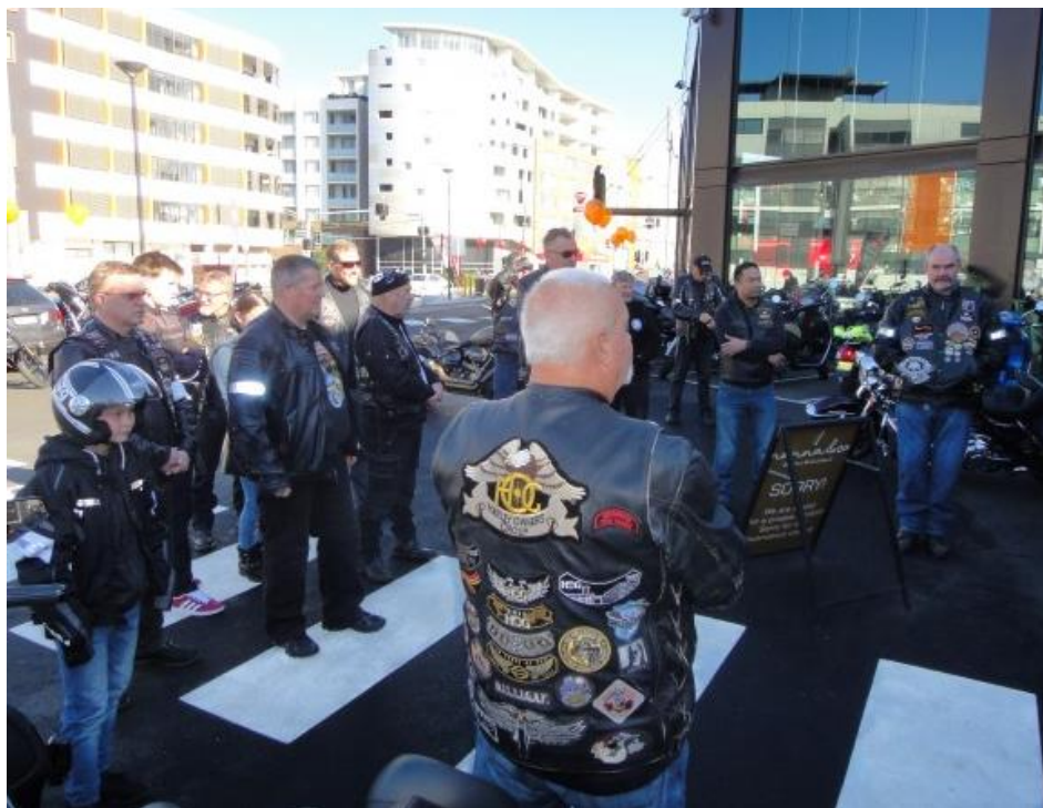
Image 12 – At 9.45 am it's time for the ride briefing to all present with mention of route, ride protocols and timing.