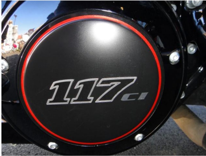
Image 5 – The Derby cover on a CVO Limited denoting the standard engine displacement of 117 cubic inches. That's 1923 cc of raw power from a 2 cylinder, 4-stroke engine.