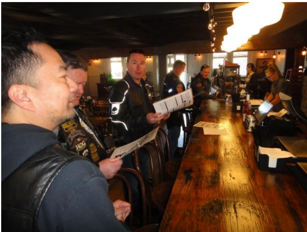
Image 28 – We make our way into the restaurant to place our lunch orders.