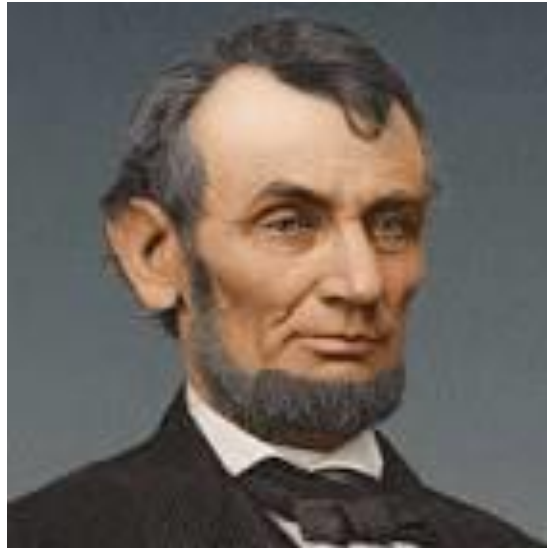
Image 34 – Abraham Lincoln served as the 16 th President of the United States from 1861 until his assassination in April 1865, aged 56 years. Lincoln led the nation through the American Civil War and presided over the Union victory, its bloodiest war and its greatest moral, constitutional and political crisis. His assassination near the end of the American Civil War was an attempt to revive the Confederate cause. He formally abolished slavery in the United States in February 1865 and is often considered the greatest President for his leadership during the American Civil War.