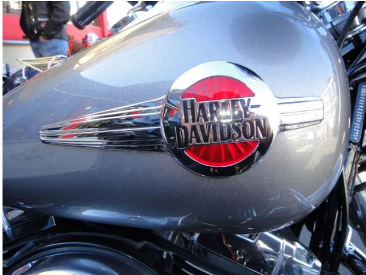
Image 7 – The fuel tank on a 2016 Heritage Softail Classic. This ‘teardrop’ tank shape was first used in 1925 and still remains very popular.