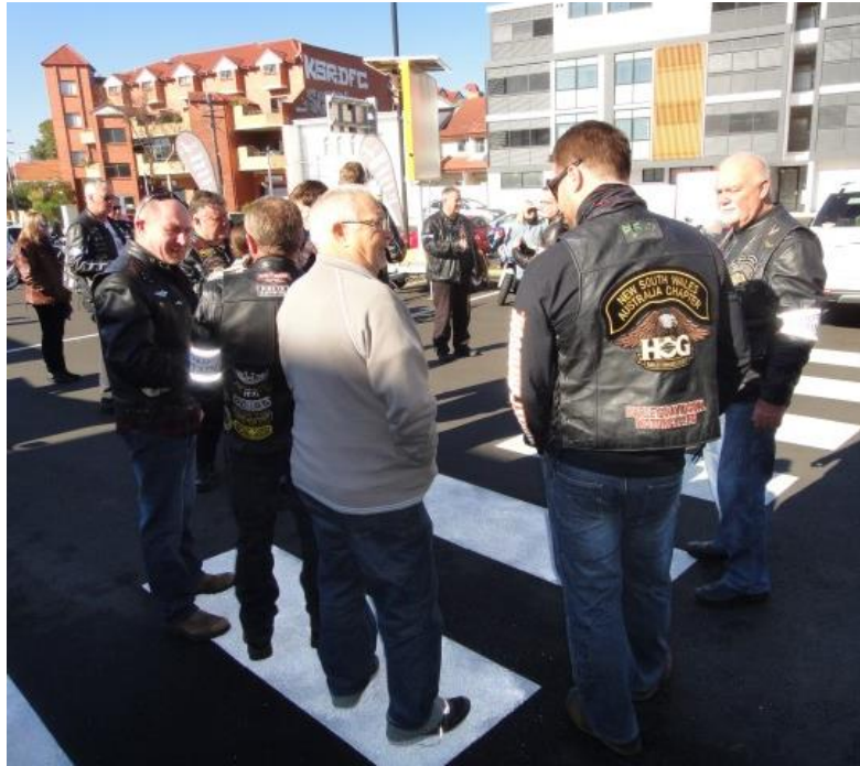
Image 3 – We all spontaneously gravitate to the outdoors to enjoy the warming winter sun. It's great to chill-out with ride buddies before the ride.