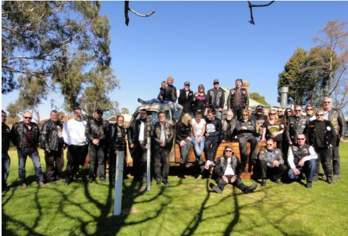
Image 31 – We all gather around a derelict old truck on the restaurant premises for a group happy-snap.

Hey, what about some Harley trivia? This is about the least known series of Harley-Davidsons in the company history.