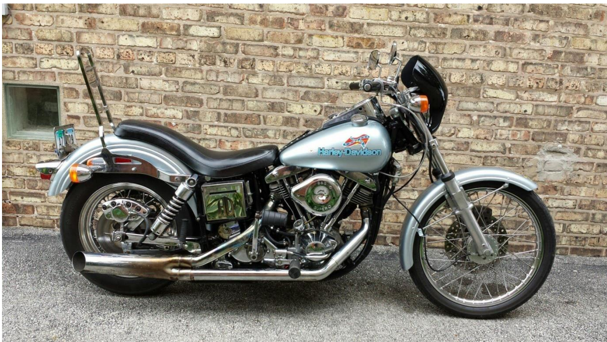
Image 35 – Confederate Edition bikes were a limited production of one batch only numbering a total of some 631 units. Only 23 are known to survive today making them very collectible.