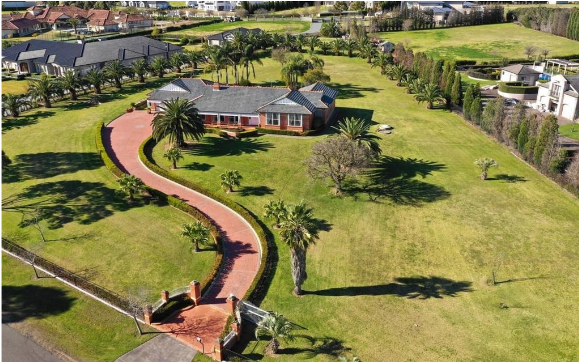
Image 19 – On ride takes us through Capitol Hill, a rural suburb of Sydney 40 kms west of the Sydney CBD. Its undulating land offers views all the way to the Blue Mountains west of Sydney. This secluded rural area is zoned rural residential with houses on acreage. The above downloaded image shows a typical home found there.