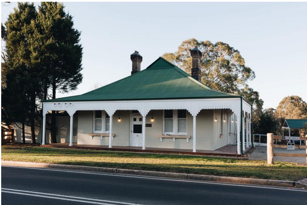
Image 22 – Downloaded image of the Settlers Restaurant, our destination for today. This is a heritage building dating back to 1890.