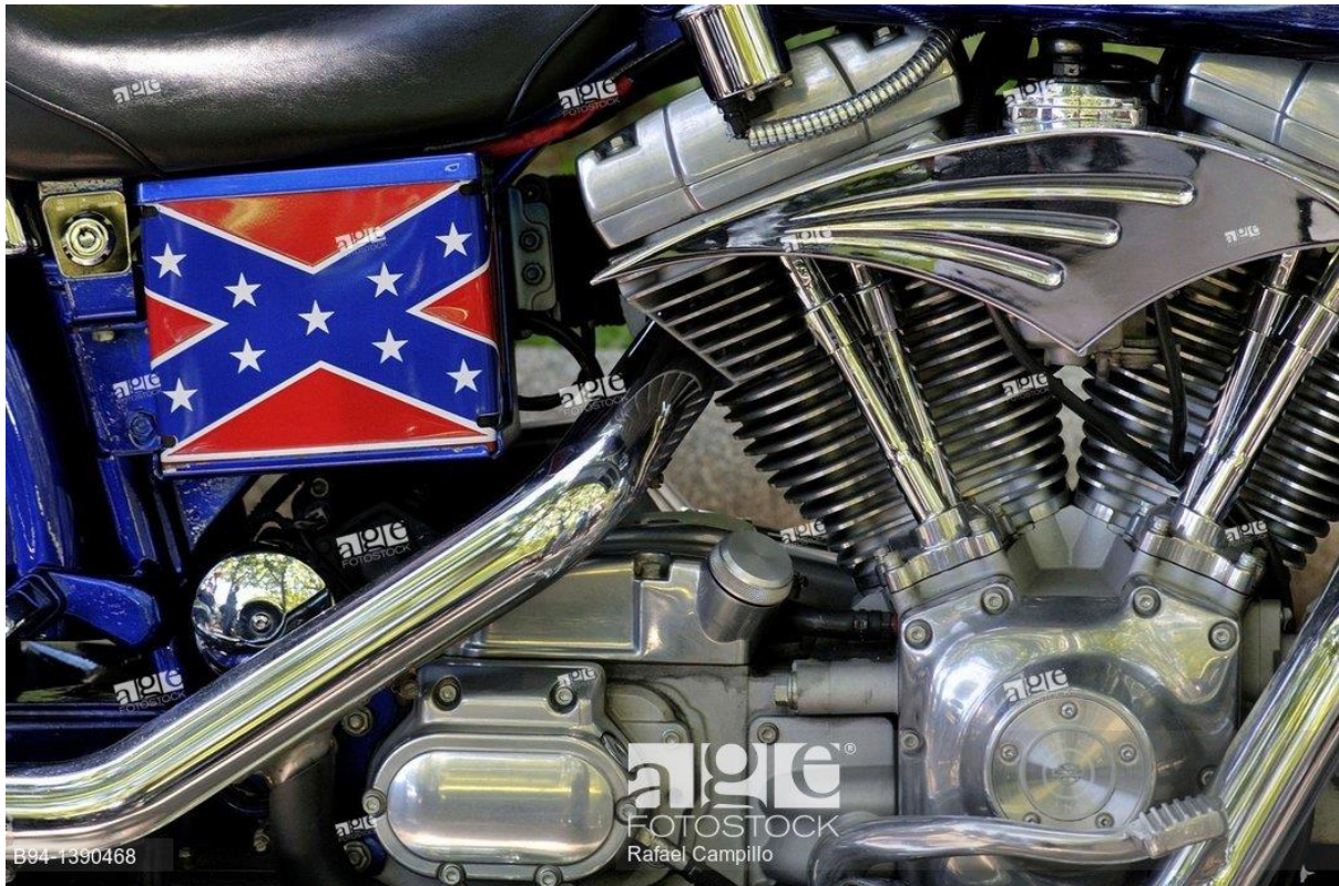
Image 38 – The Confederate Edition now remains just a fascinating footnote in the history of Harley-Davidson.