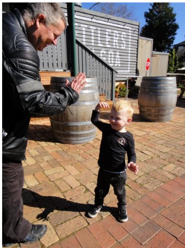
Image 26 – On our way to the back entrance we were all individually greeted by this cute little kid, the son of an unknown patron. He high-fived everyone! Looks like the scary old biker look isn't working all that well!