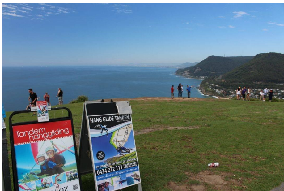
Image 21 – Adventure seeking hang gliders will launch themselves off of Bald Hill with up draughts sweeping them away over the coastline like a bird.