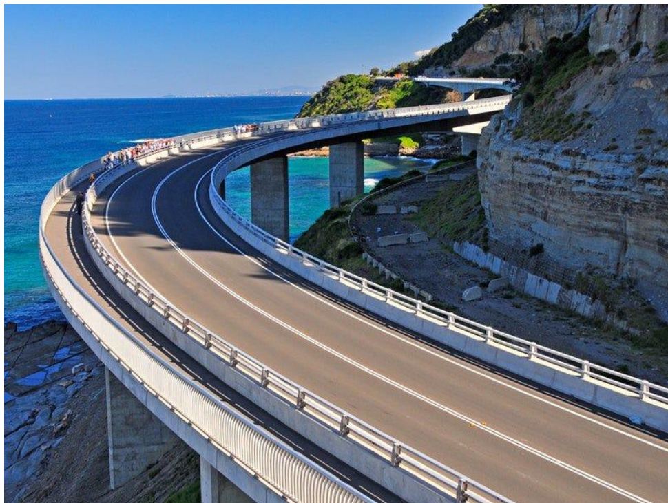
Image 27 – This new route is now billed as New South Wales' answer to Victoria's famous Great Ocean Road. An estimated 11,000 cars and bikes use this new roadway each weekend. The smoothly flowing curves follow the cliff face and negotiating this road on a bike is delightful with great views over the ocean. Note the debris from fallen rocks on the old road adjacent to the cliff face.