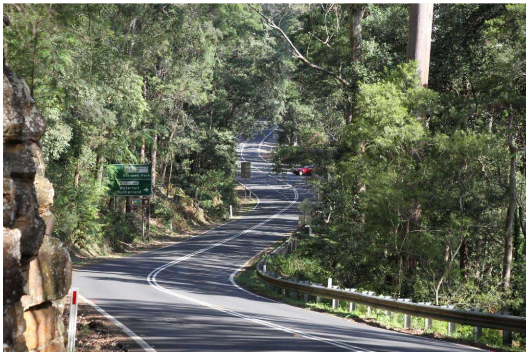
Image 13 – As mentioned, there are very few intersections along the road through the Royal National Park.