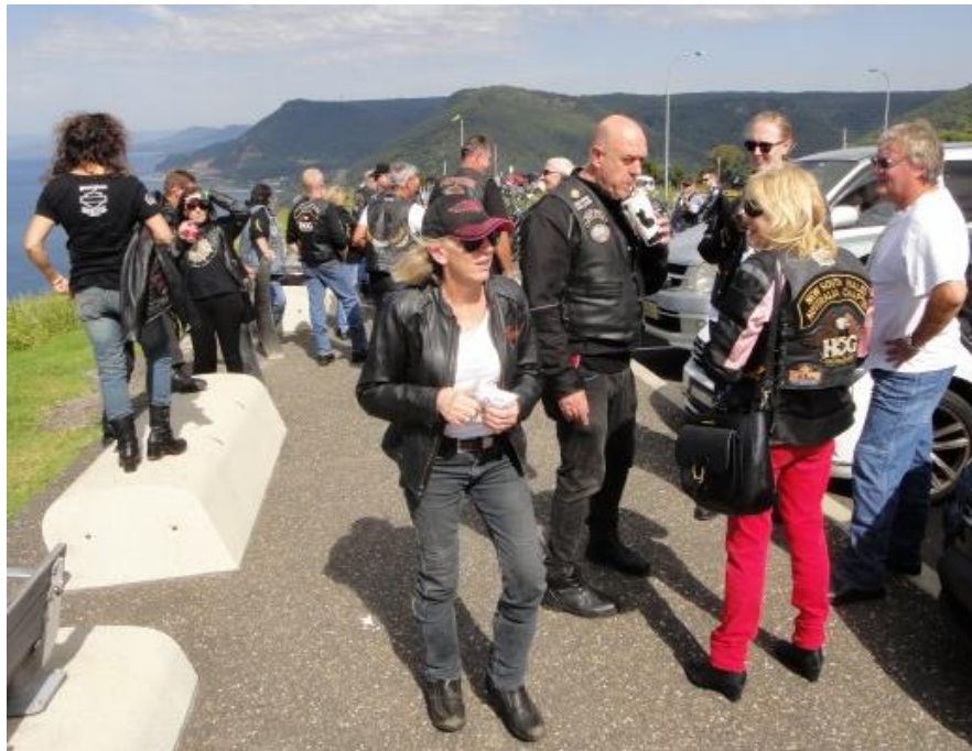
Image 18 – Bald Hill is a favourite meeting point for bikers and car clubs, particularly on weekends. It's easy to strike up a conversation with fellow riders / motorists here.