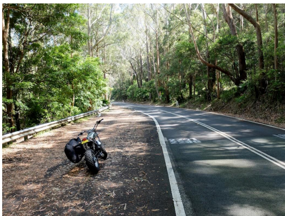
Image 15 – Riding through the Royal National Park you experience a breathtaking combination of open straights and technical bends surrounded by dense rainforest leaving you quite satisfied when you suddenly emerge on the coast at Stanwell Tops.