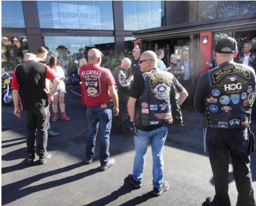
Image 1 – We gather at our sponsoring dealership premises before the ride. Coffee and breakfast is available to us at their adjacent restaurant ( Nonna's).