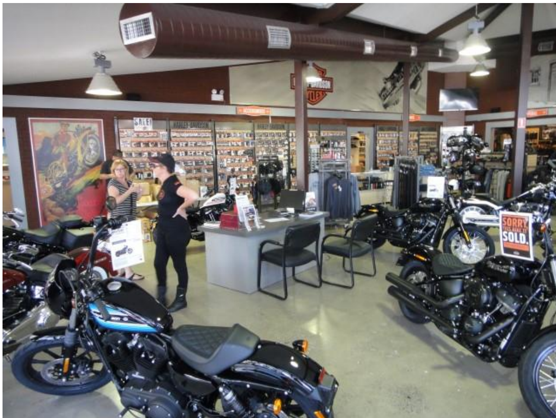
Image 35 – Inside the Fraser dealership at Fairy Meadow. Everything here looks very familiar to me.