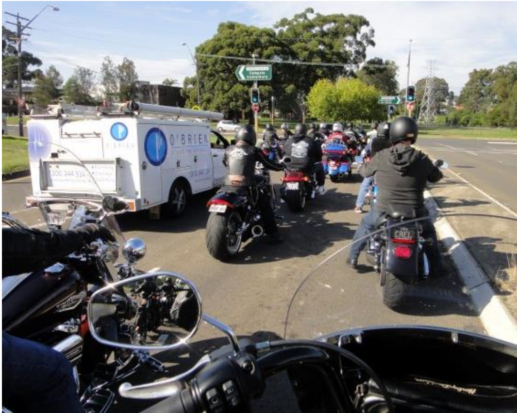
Image 7 – This is what we look like on the road and here we are on Coronation Parade at Enfield not far from our start point.