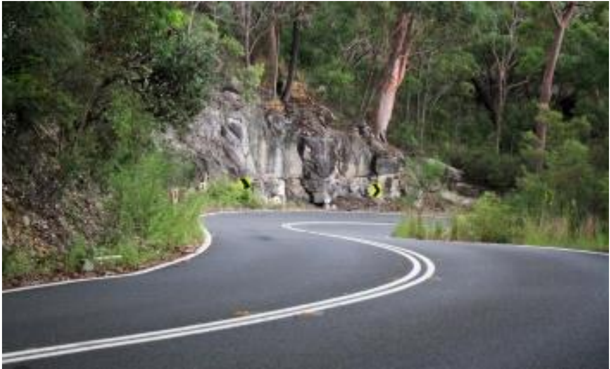
Image 12 – The National Park road is in close proximity to the surrounding flora so one needs to be aware of the possibility of fallen branches, wildlife crossing and damp sections of roadway due to the enclosed overhead canopy in parts of the roadway. The local wildlife includes wallabies, goannas, and pest feral animals such as dogs, cats, foxes, deer and rabbits. We did not encounter any animals on our trip today.