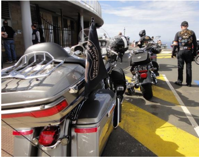
Image 16 – We suddenly emerge from the National Park at Stanwell Tops right on the coast where there is a very popular and magnificent lookout at Bald Hill which has sweeping views over the ocean. Here at the Bald Hill carpark there is a café and restrooms available (it's called Bald Hill due to its lack of trees in the immediate vicinity).