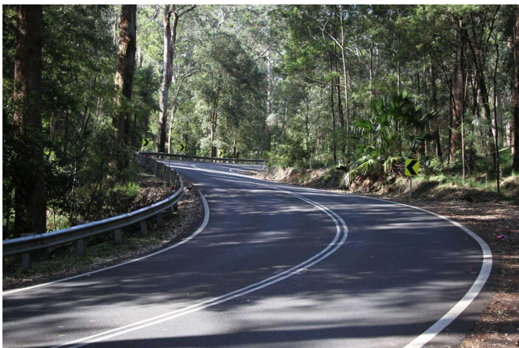
Image 14 – A nightmare for cagers but nirvana for bikers, THIS is a ride in the park!