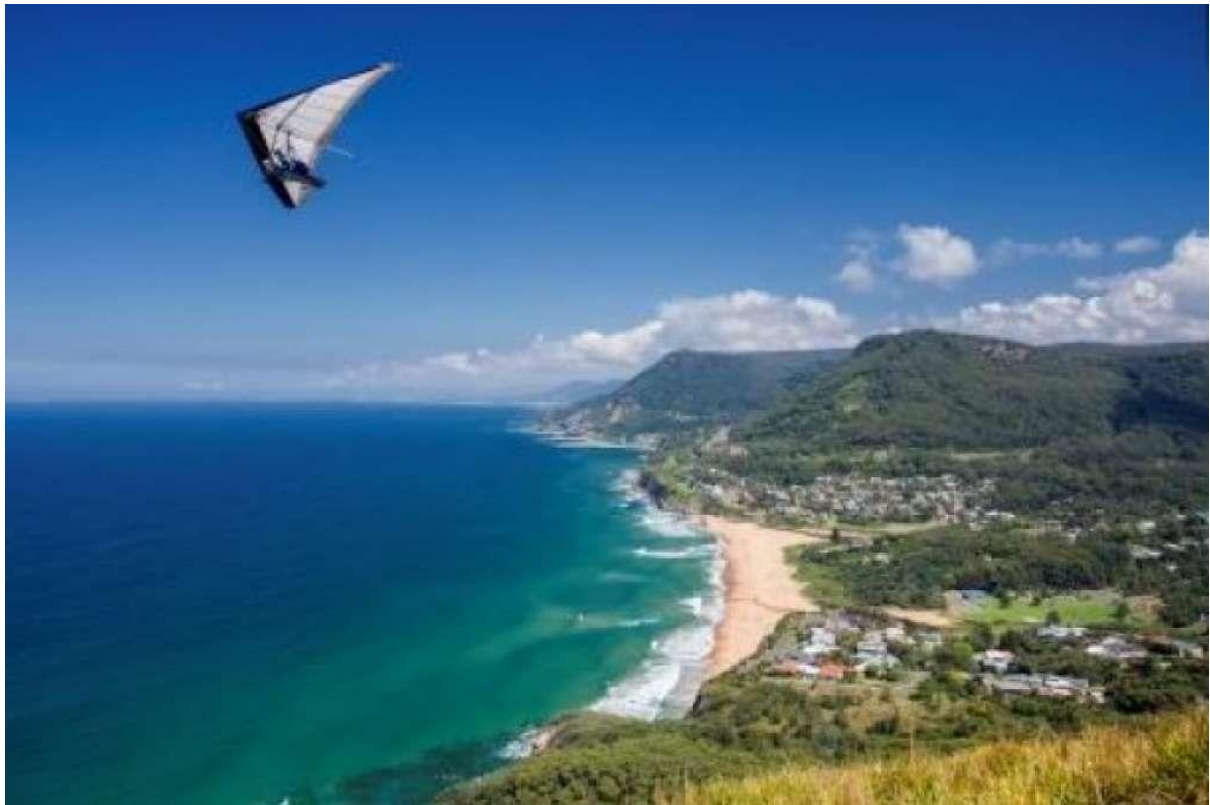
Image 20 – Bald Hill is a world renowned location for hang gliding as it is perched high above the adjacent coastline offering spectacular views. As good as these views are, bikers will probably spend more time looking at all the bikes and talking to other riders.