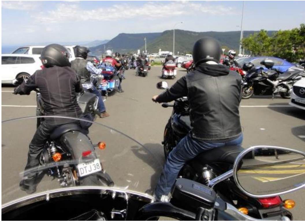
Image 24 – We now head off towards the Sea Cliff Bridge, the road ahead winding its way through sea-side villages along the coastline. Our route here is along Lawrence Hargrave Drive which is part of a tourist route called “The Grand Pacific Drive” which takes you through the Royal National Park, and through to Wollongong, Kiama, Shoalhaven and beyond. Distance to our final destination from here is about 25 km.