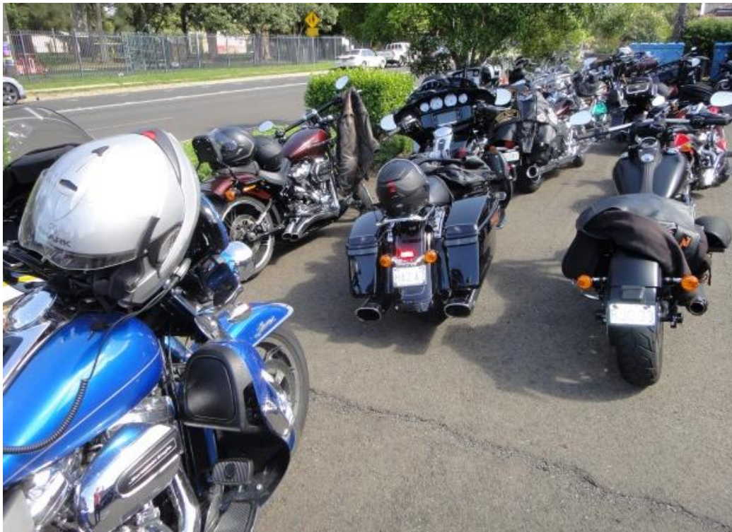
Image 34 – While we all are enjoying our sausage sizzle our trusty iron steeds compose a very interesting image.