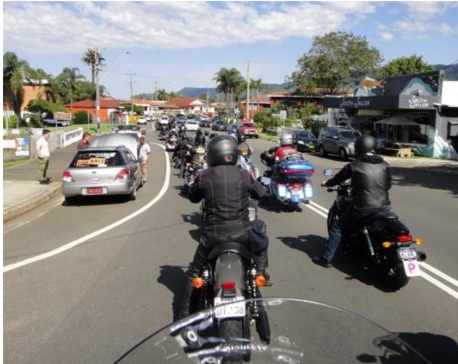
Image 28 – With the Sea Cliff Bridge behind us we now head southbound through beachside suburbs on route to Fraser's at Fairy Meadow.