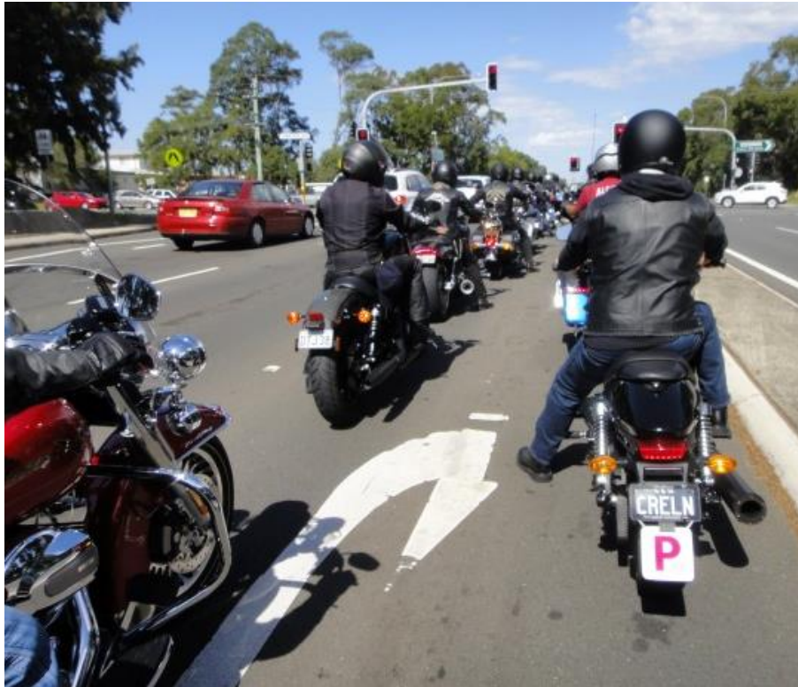
Image 30 – Approaching our final destination of Fairy Meadow we will turn right here with our destination just down the road.