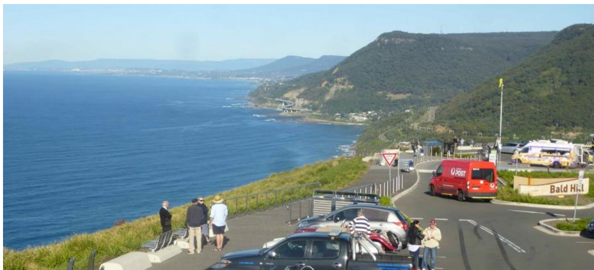
Image 19 – Here we see the view from Bald Hill and in the distance a glimpse of the Sea Cliff Bridge along the coastline where we are soon headed. Further south is the city of Wollongong where the “mountains meet the sea”. Note the lack of trees on Bald Hill.