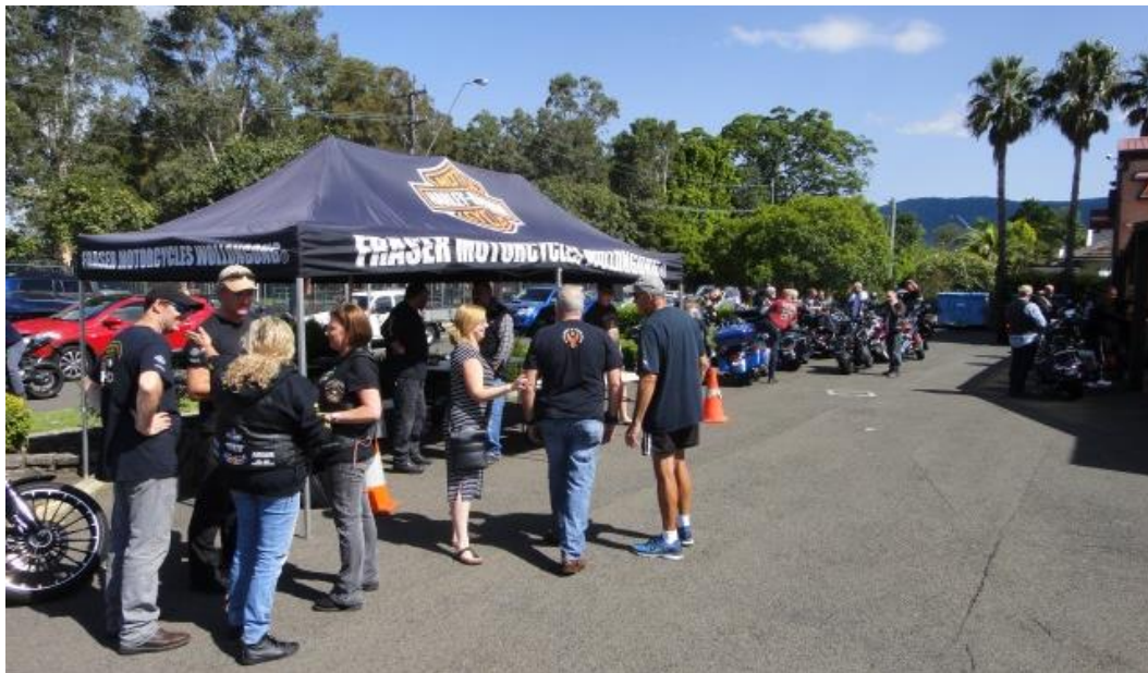
Image 31 – We arrive at Fraser's Wollongong at 12.30 pm with distance travelled today a mere 81 km, just a small hop on a motorcycle. The HOG South Coast Chapter were kind enough to put on a sausage sizzle for all with drinks included which was much appreciated by all in attendance.