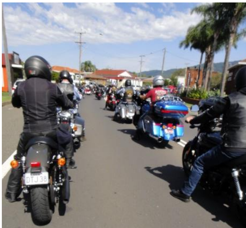
Image 29 – Unlike Sydney, these beach-side suburbs near Wollongong are not (yet) overdeveloped with high-rise apartments.