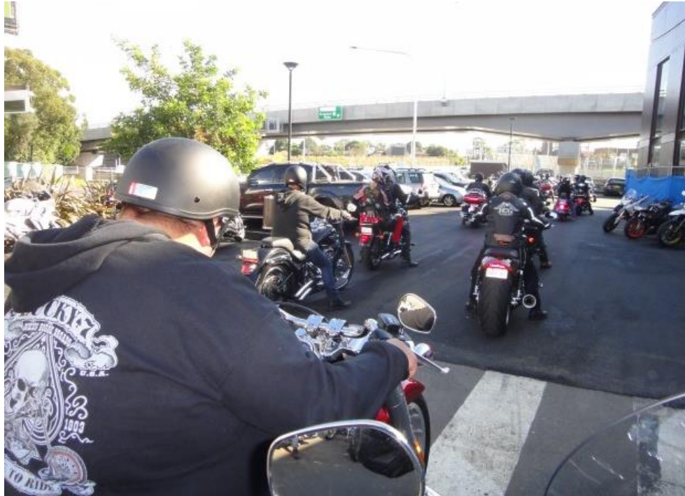
Image 4 – Right on schedule at 10 am we depart Fraser's compound. At left is new member Glen aboard his 2019 Fatboy model.