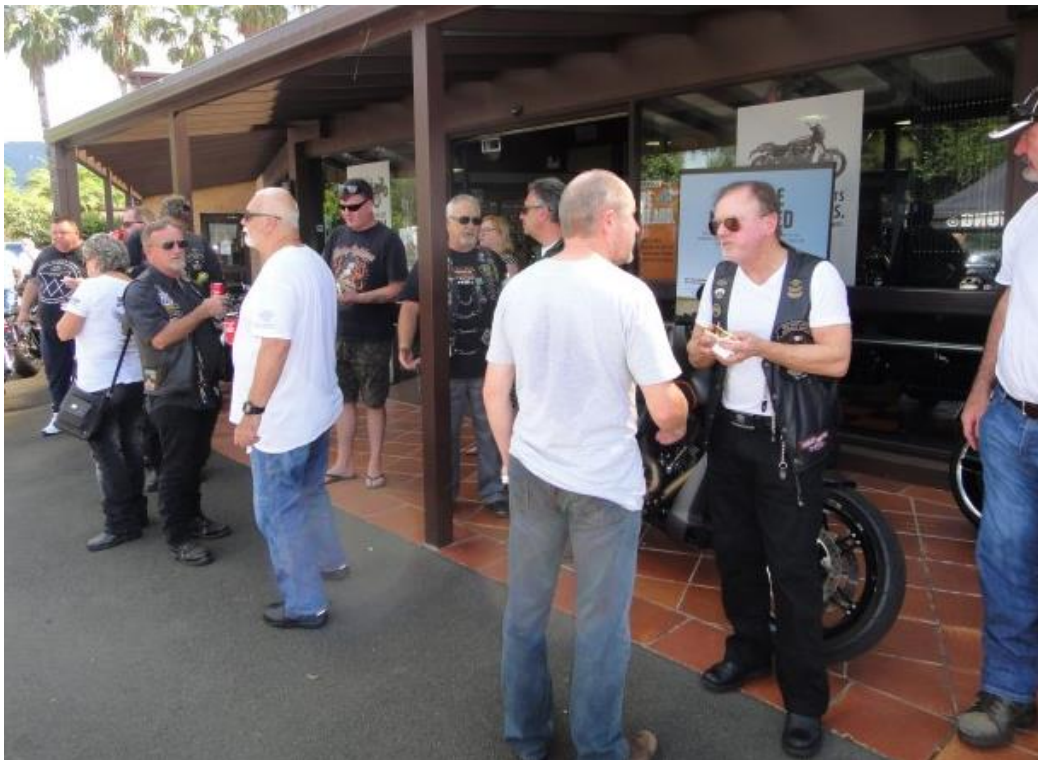
Image 33 – It doesn't take long for us to settle in and enjoy the hospitality and comradery of our HOG brothers and sisters from the South Coast Chapter.