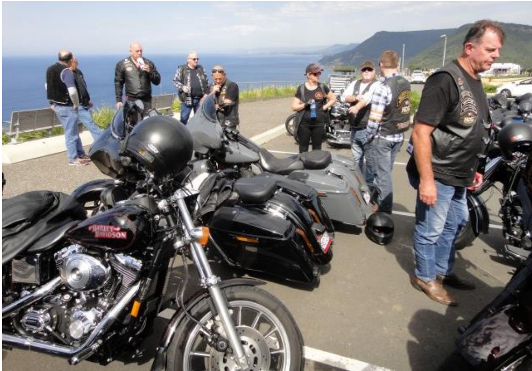
Image 22 – Bikers gather at Bald Hill alongside their machines, hot exhausts ticking loudly as they cool, describing their adventures of riding through the Royal National Park.