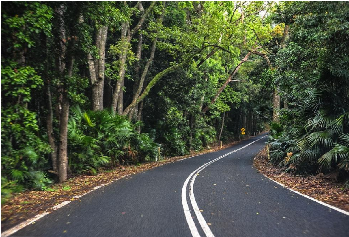
Image 11 – After travelling about 40 km through congested Sydney suburbs we access The Royal National Park near Heathcote for the 20 km run through the Park. We will then reach Bald Hill for a brief stop and meet up with HOG NSW South Coast Chapter members. Then we will all ride on together to our final destination at Fairy Meadow.

The Royal National Park road is a favoured biker's route passing through a tunnel of eucalyptus rich bushland as it twists and turns, rises and falls and throws just about every type of corner imaginable at you. Some bends are blind requiring great caution to negotiate. As you can see, it's a two lane road all the way with very few intersections.