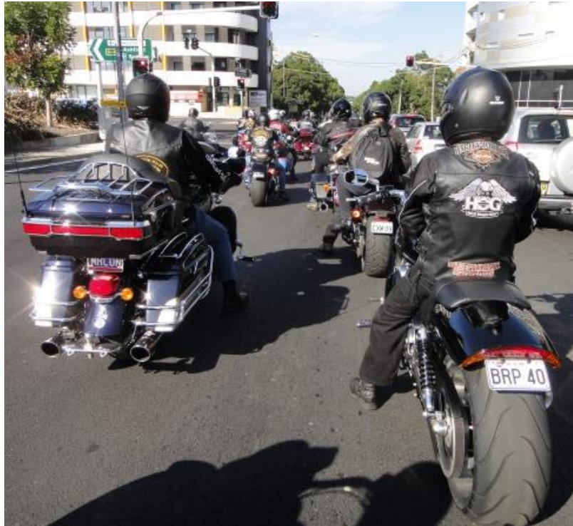
Image 5 – We like to ride in formation and stay together to enjoy the sights and sounds of a bunch of Harleys.