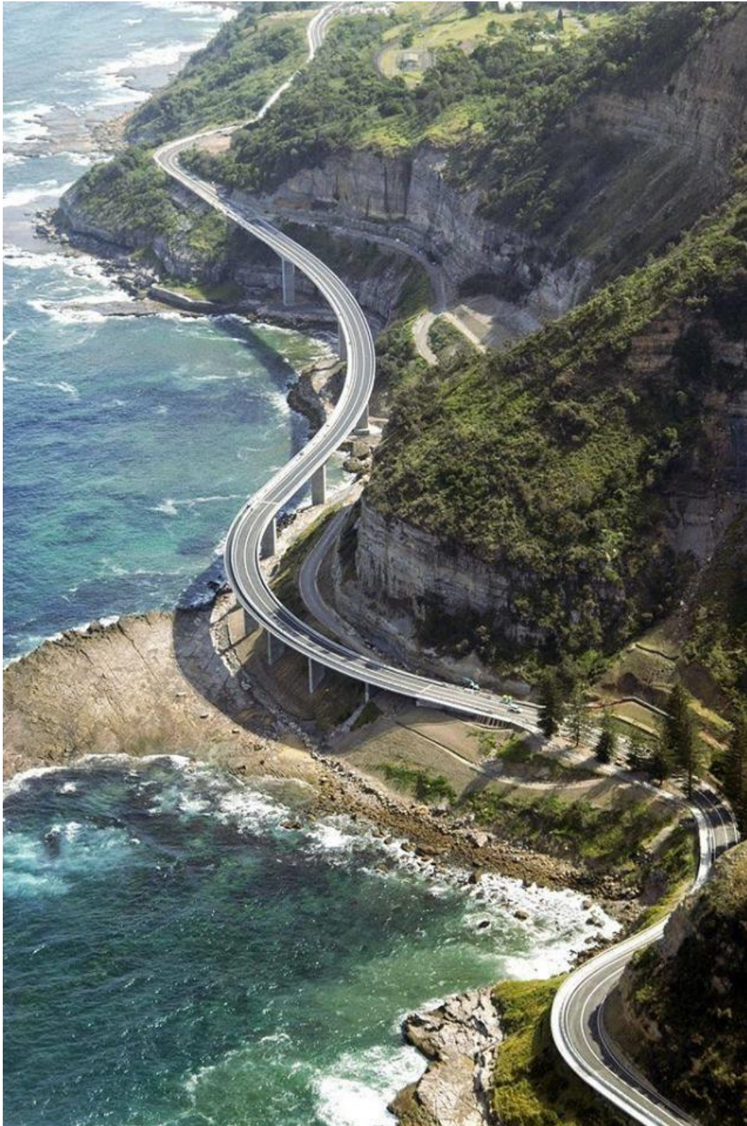
Image 25 – A downloaded image of the Sea Cliff Bridge (which was opened in 2005) with its spectacular coastline. The old road can be seen along the edge of the coast which was always subjected to falling rocks from the adjacent cliff face. In fact in 2003, a major land-slip resulted in this road being closed indefinitely and this led to the construction of the new bridge away from the cliff face and obviously no longer subjected to falling rocks.